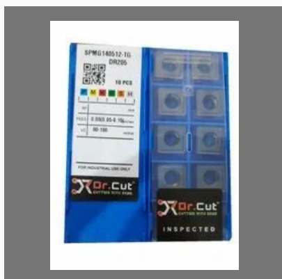
SPMG140512TG DR205 Dr Cut U Drill Insert