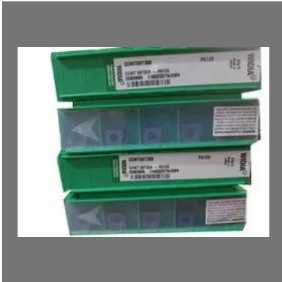
CCMT09T308 Widia Turning Insert