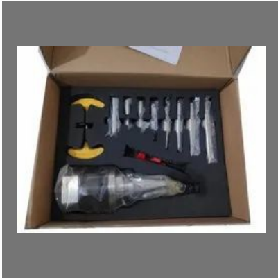
VMC Boring Kit