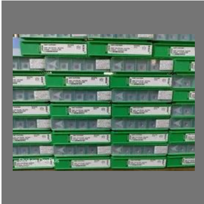
SDMT1204PDRMH WU20PM Widia Carbide Insert