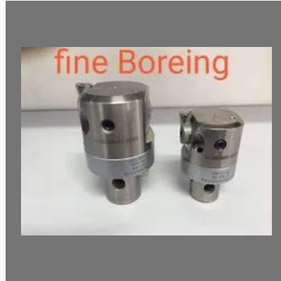
Fine Boreing Head