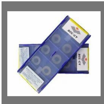
RDKW1204MO ZCCCT Milling Insert