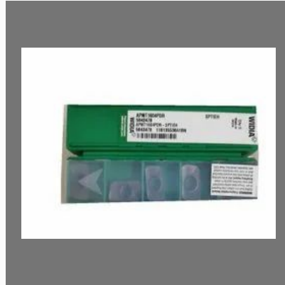
APMT1604PDR Widia Milling Insert