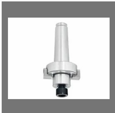
BT40 Face Mill Arbor