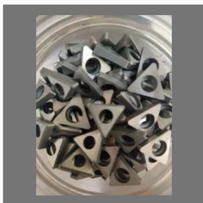
TNMG Carbide Shim