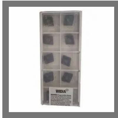
CCMT060208R Widia Turning Insert