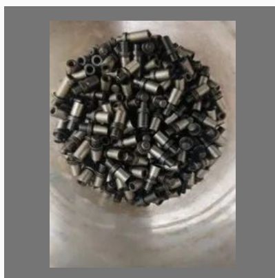
TNMG Shim Pin