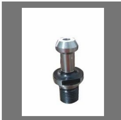
VMC BT40 45 Degree Through Coolant Pull Stud