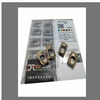
Apmt160408 Dr Cut Milling Insert