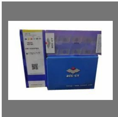
Apmt160408pder Zccct Milling Insert