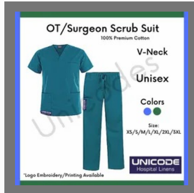
OT SCRUB SUIT