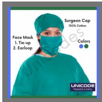
Unicode Blue Cotton Surgical Face Mask