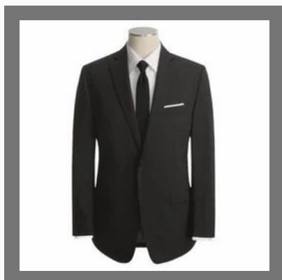
MEN'S BLACK COAT / BLAZER