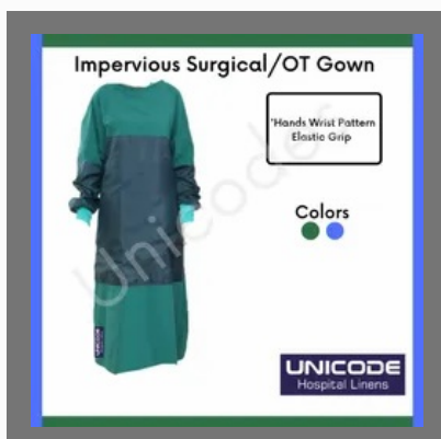
COTTON IMPERVIOUS GOWN - REUSABLE