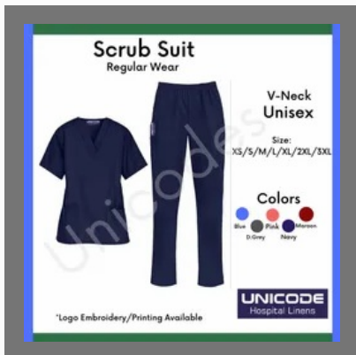
Doctors Scrub Suit