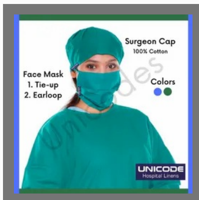
Green Surgical Face Mask