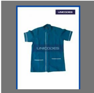
Hospital Uniform For Nurses