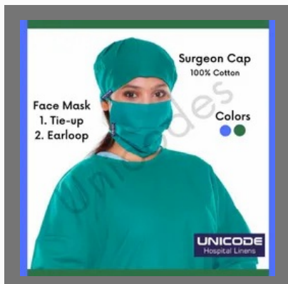
Cotton SURGEONS CAP