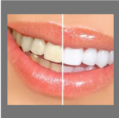
Tooth Whitening Service