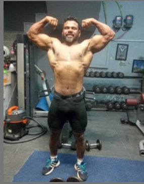
Weight Gain Training Class