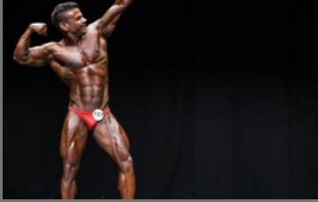
Body Building Training Class