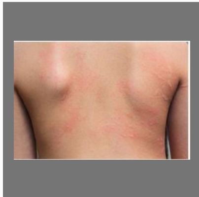
Skin Problems Treatments Service