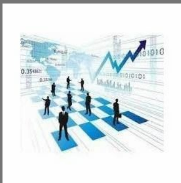
Corporate Advisory Service