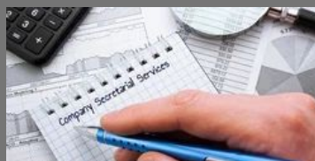
Corporate Secretarial Service