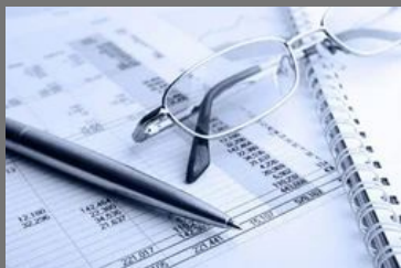
Income Tax Consultancy Service