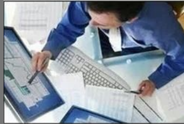
Concurrent Auditing Service