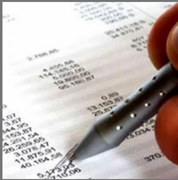
Statutory Auditing Service