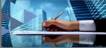
Project Report Preparation Service