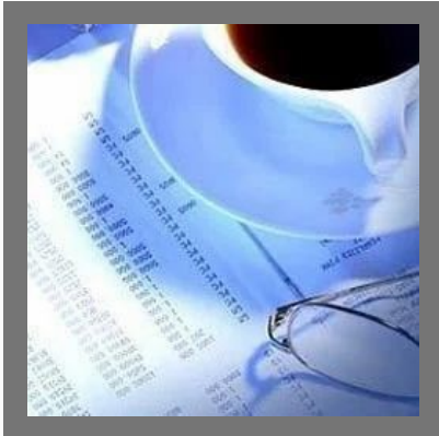
Stock Audit Consultancy Service