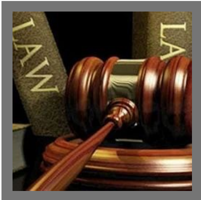
Company Law Matters Consultancy Service