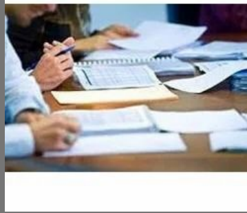
Internal Auditing Service