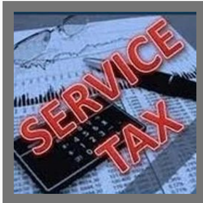
Service Tax Consultancy Service