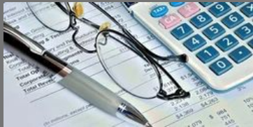
Tax Auditing Service