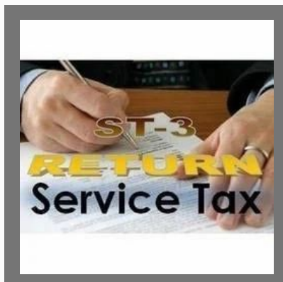
Service Tax Return Service