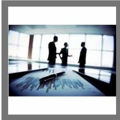
Investment Consultancy Service