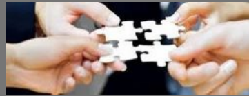
Tax Planning Service