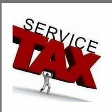
Service Tax Assessment Service