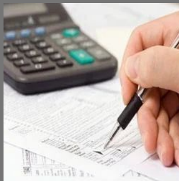
Income Tax Assessment Service