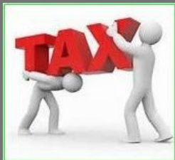
Tax Saving Options