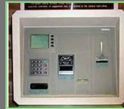
Value Deposit Financial Services