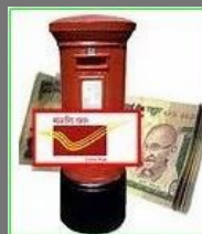
Post Office Schemes