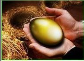
Secure Future Financial Service