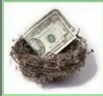
Investment & Management