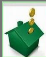
Capital Gains Exemption Bonds