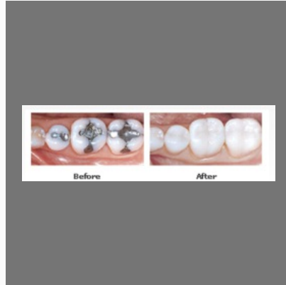
Inlays, Onlays Treatment