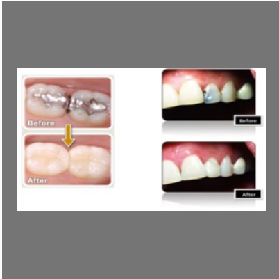
Tooth Colored Restorations