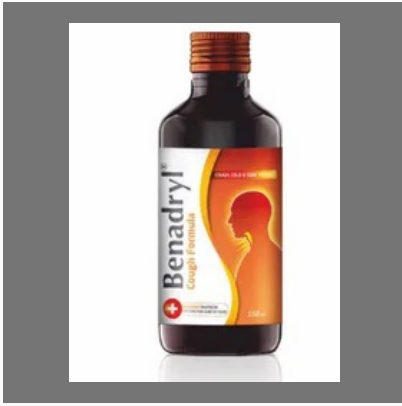
Benadryl Cough Formula Syrup