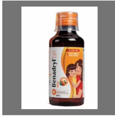
Benadryl Cough For Kids Syrup