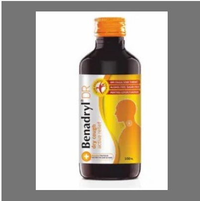
Benadryl Dry Cough Syrup