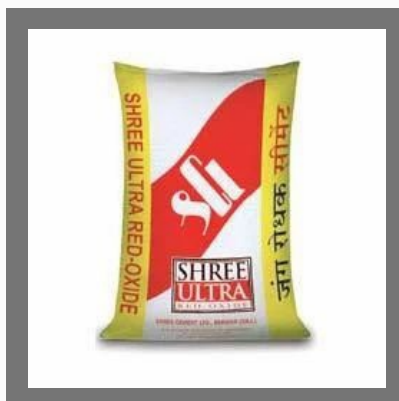
OPC and PPC Cements