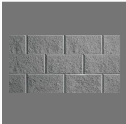
AAC Block Joining Mortar