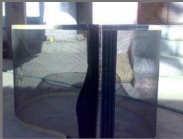
Ptfe Coated Glass Cloth Bullnose Joint