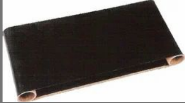
Ptfe Coated Glass (Seamless Belts ) Conveyor Belts