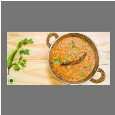
Daal Fry Punjabi N Jain