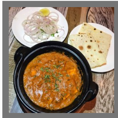
Paneer Tikka Masala