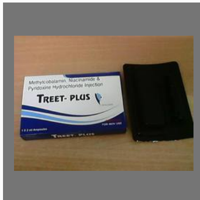
Treet Plus Medicines