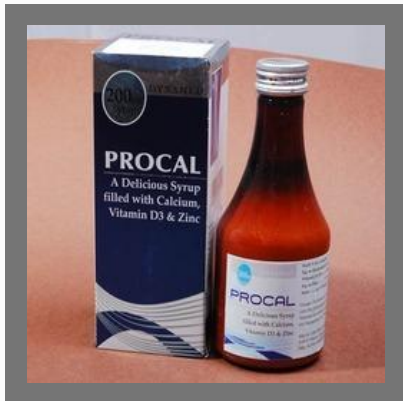
Elemental Calcium & Vitamin D Syrups