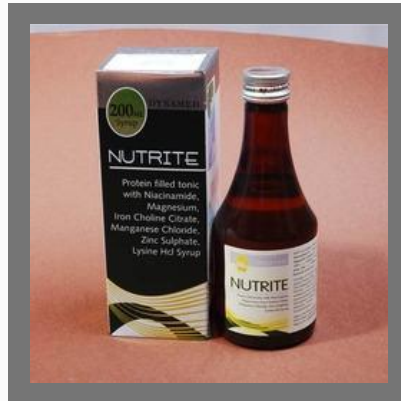
Protein, Zinc & Lysine Syrups