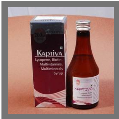
Lycopene, Biotin & Multiminerals Syrups