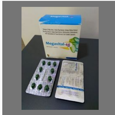
Megavital- 4 G