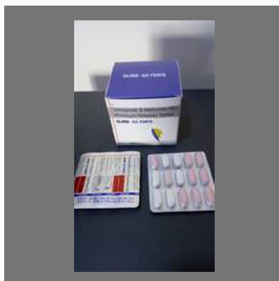
Glimes G3 Forte