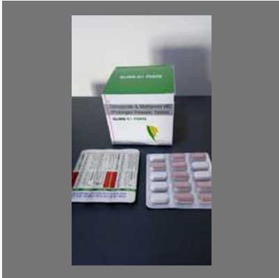
Glims G1 Forte