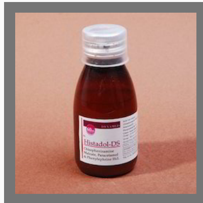
CPM & Phenylephrine HCL Suspensions