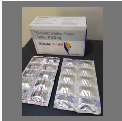
Dsoval Cr - 500