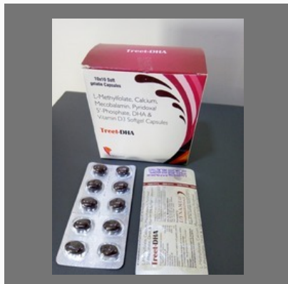
TREET - DHA