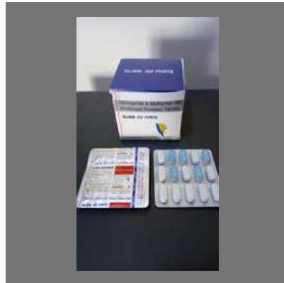
Glims G2 Forte