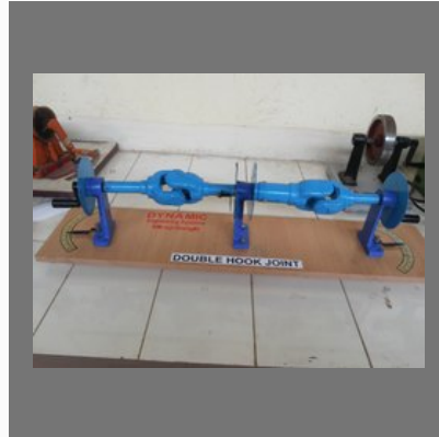
Double Hook Joint