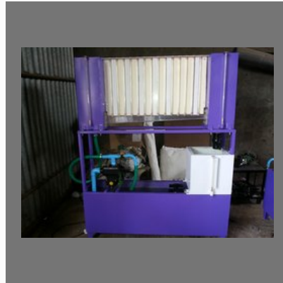
Bernoulli's Theorem Apparatus