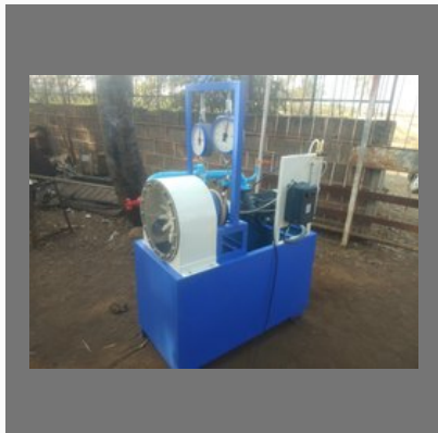
Mini Pelton Wheel Turbine Test Rig