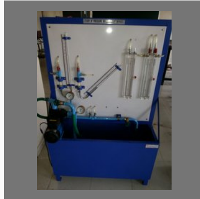
Study of Pressure Measurement Devices