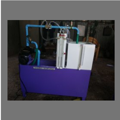
Flow Measurement by Orificemeter