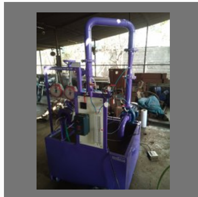
Francis Turbine Test Rig.