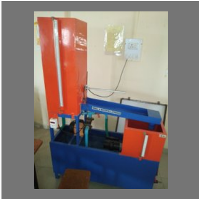
Flow Through Orifice & Mouthpiece Apparatus