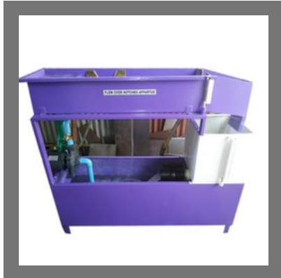
Flow Over Notches Apparatus