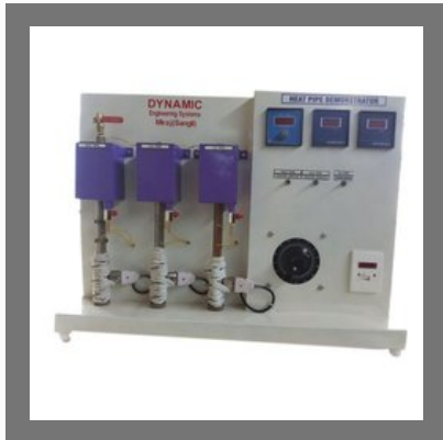
Heat Pipe Demonstrator