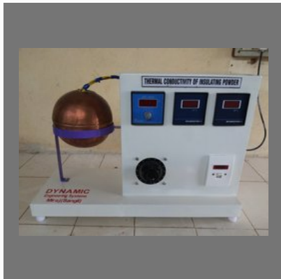
Thermal Conductivity of Insulating Powder