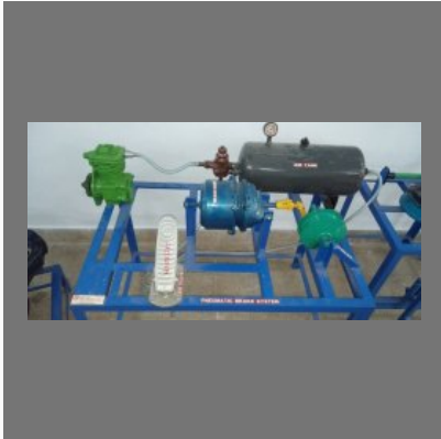
Pneumatic Brake System