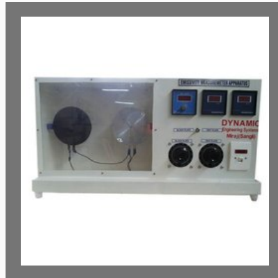
Dynamic Emissivity Measurement Apparatus