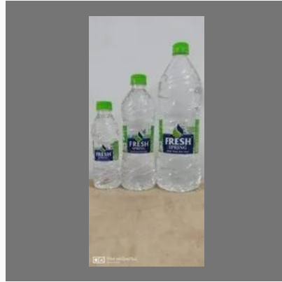
Packged Drinking Water