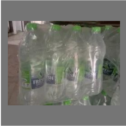
Packaged Drinking Water