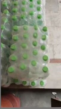
250 Mlpackaged Drinking Water