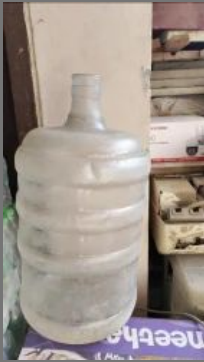
Jar Drinking Water