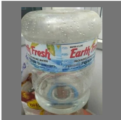
Water Bottel 20 L