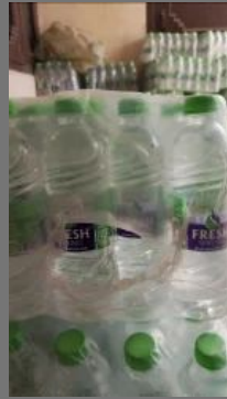
1 Ltr Drinking Water