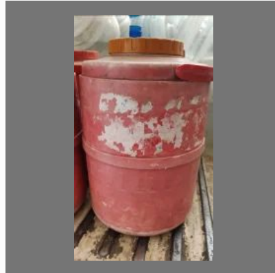
Water Cooler Drinking Water