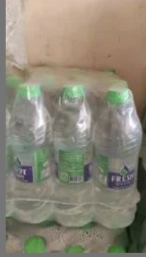
1 Ltr Packaged Drinking Water