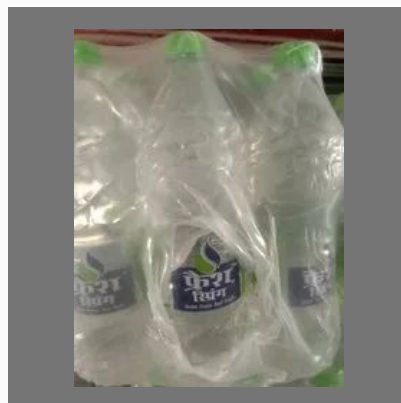
1 Ltr Packaged Drinking Water