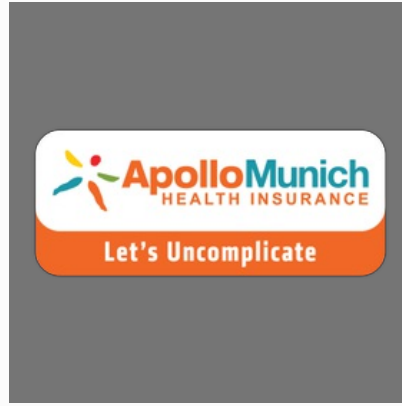
Health Insurance Services