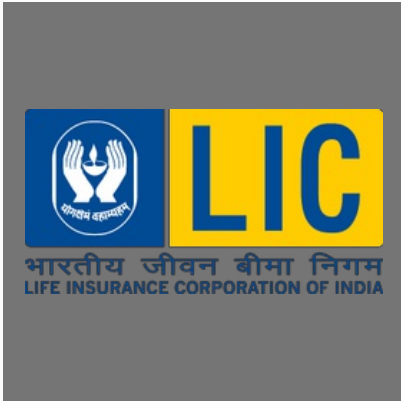
Life Insurance Corporation Of India