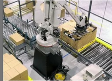
Material Handling Machine