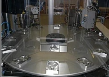
Assembly Line Automation Machine