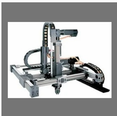
Pick & Place And Process Line Automation