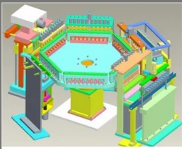
Special Purpose Machines (SPM)