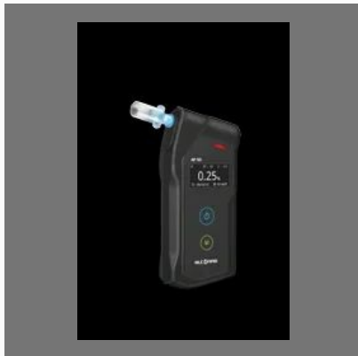
AF-50 Digital Breathalyzer