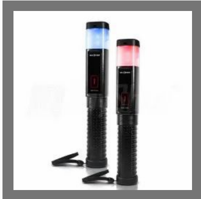
AF-100S Alcohol Screening Breathalyzer