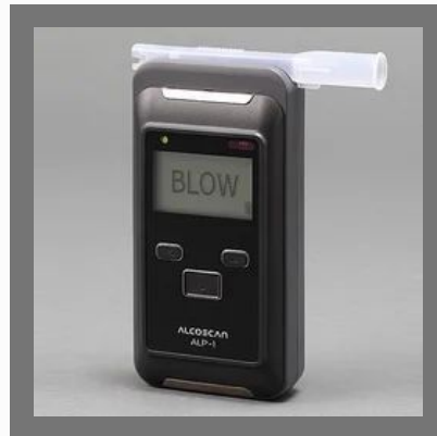
Alcoscan ALP-1 Fuel Cell Sensor