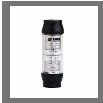
BI-DIRECTIONAL VARIABLE AREA FLOW METER