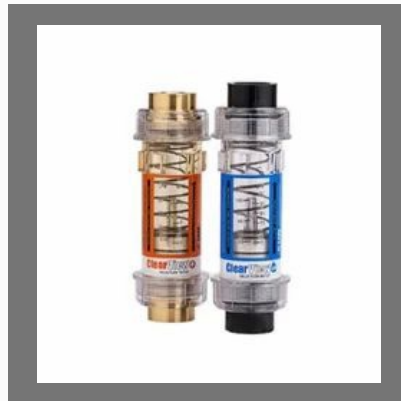
CLEARVIEW VALUE FLOW METER