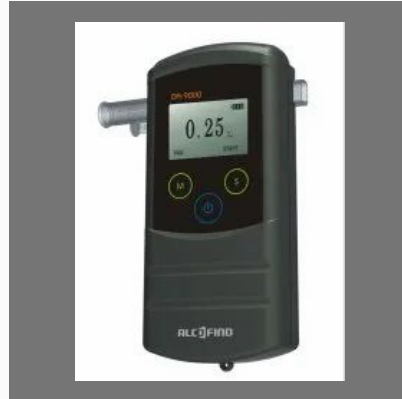
DA 9000 Alcohol Breathalyzer