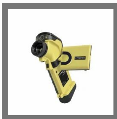
EC Series Thermographic Camera