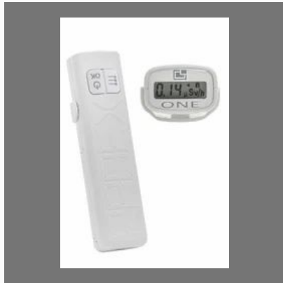
Radiation Personal Dosimeter