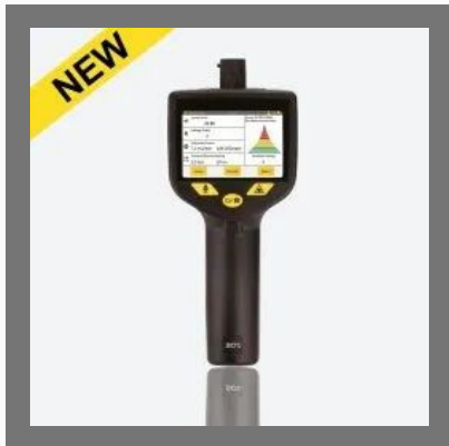
S531 Ultrasonic Air Leak Detector With Camera, Voice Recorder, Report Generation