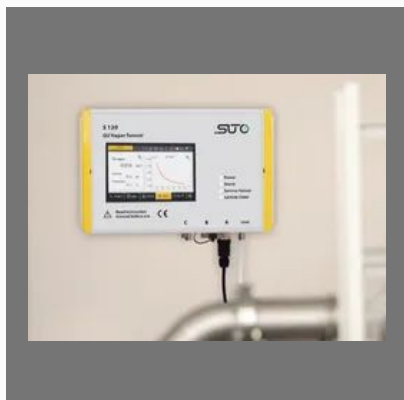
Oil Vapor Sensor For Compressed Air/ Gases Model SUTO-iTEC S120