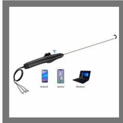
4mm 2 way Wifi/USB/OTG Articulating Videoscope