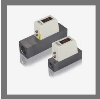
Thermal Mass Flow Sensor For Small Diameter Pipes