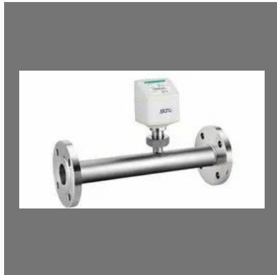
Thermal Mass Flow Meter For Compressed Air/ Gases