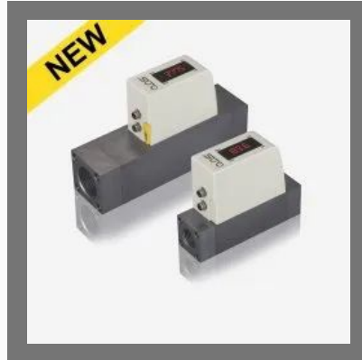
Vacuum flow Sensor - SUTO- iTEC