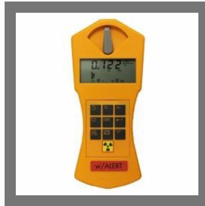
Radiation Survey Meter cum Dosimeter/Geiger Counter