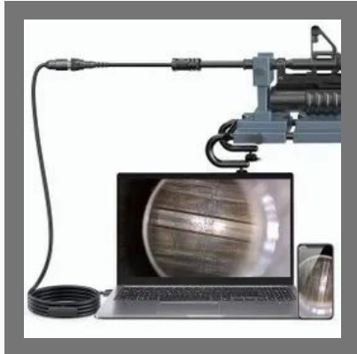
Rifle Barrel Borescope Inspection