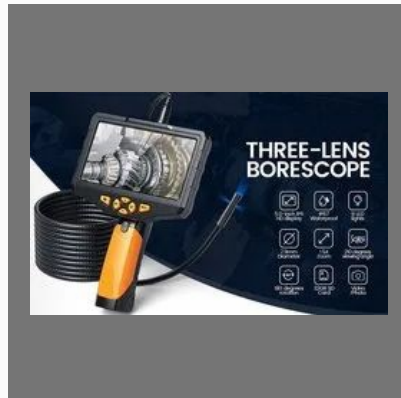
3 lens 7.9mm Borescope