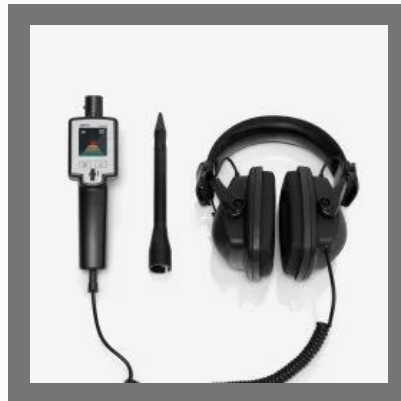
SUTO-iTEC Ultrasonic Air Leak Detector