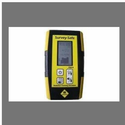
Simulated Radiation Training Meters