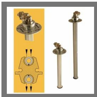
Duct Air Flow Measuring Probe