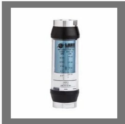
CASE DRAIN FLOW METER