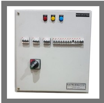
3 Way Lighting DB Panel