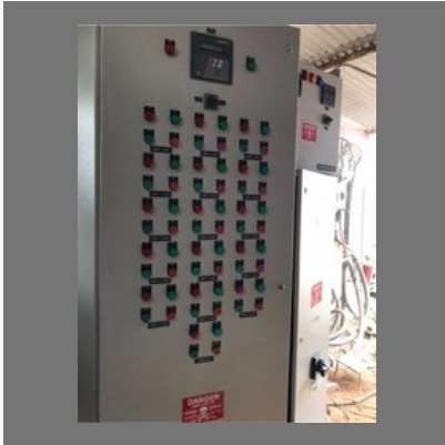
345 Kvar Apfc Panel