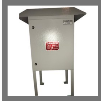
Power Distribution Board