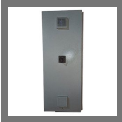
PLC Control Panel