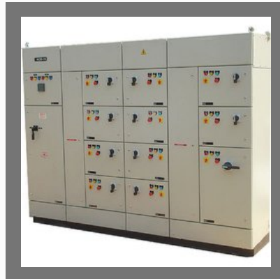
Main LT Control Panel