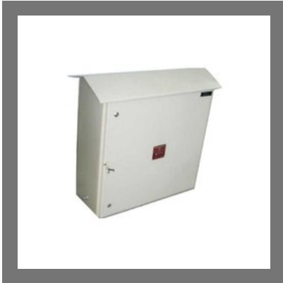
Waterproof Junction Box