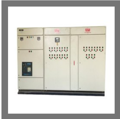
Three Phase Apfc Panels