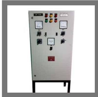
Three Phase Amf Panel