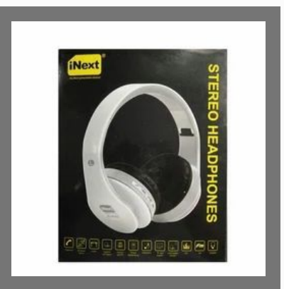
Wireless Stereo Headphone