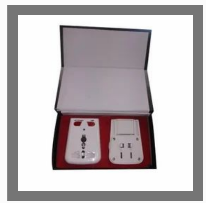
Digital Spy Camera