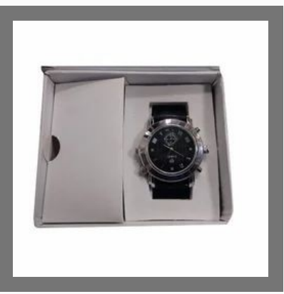
Spy Watch Camera