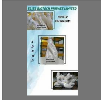
Oyster Mushroom Seed