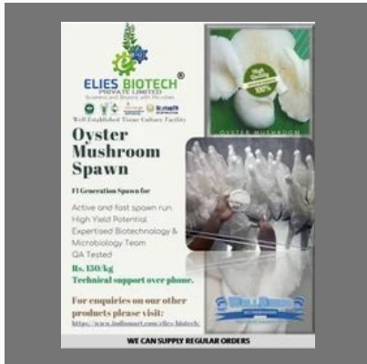
Milky Mushroom Seeds Spawn