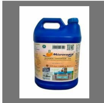
Inoculum Bacteria For Biotoilet