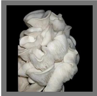
Oyster Mushroom Seed