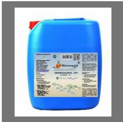
Bio Culture For Wastewater Treatment