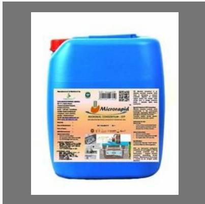
Sewage Odour Removing Bioculture