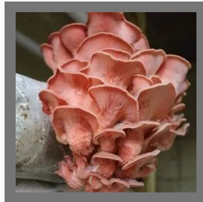
Pink Oyster Mushroom Spawn