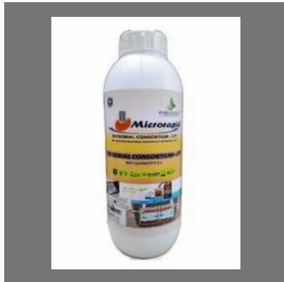
Sewage Treatment Plant Stp Bio Culture