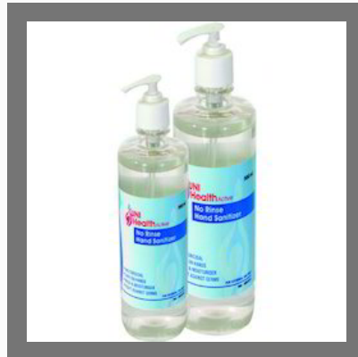
Hand Rub Solution