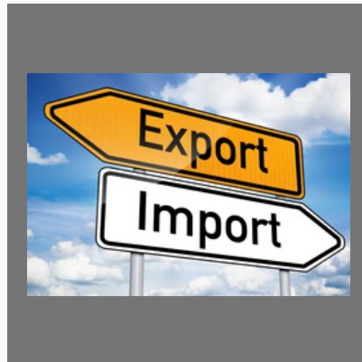
Export License Consulting Service