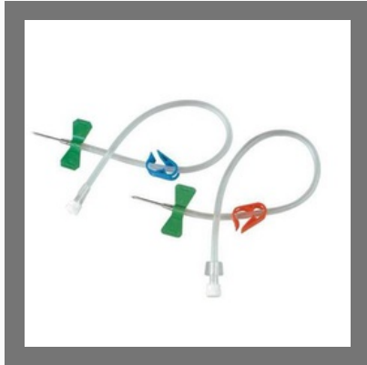
A.V. Fistula Needle