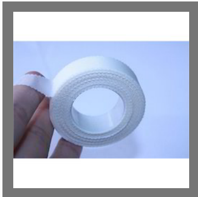
First-Aid Adhesive Tape