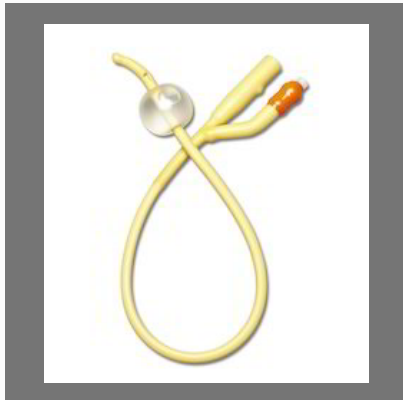
Latex Foley Catheter