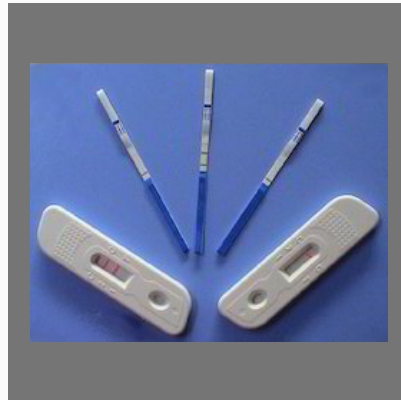
Rapid Diagnostic kits