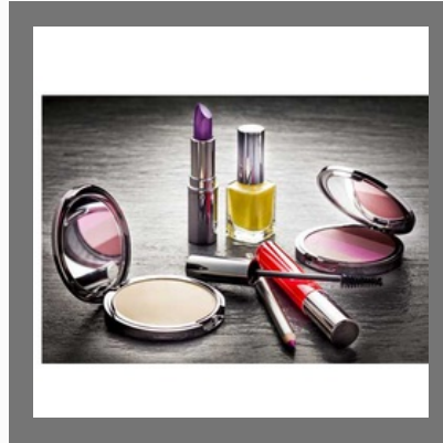
Cosmetic Consulting Service