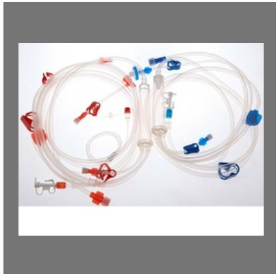
Hemodialysis Blood Tubing Set