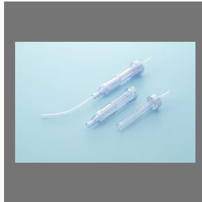
Orthopaedic Suction Set