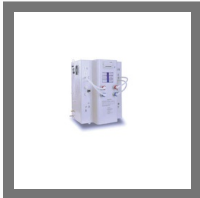
Neproton Dialyzer Reprocessor Machine