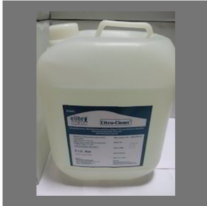
Hemodialysis Machine Disinfectant