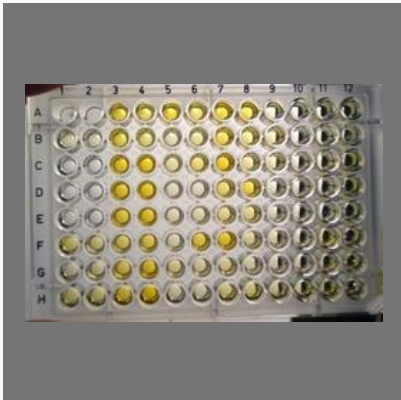
Elisa Diagnostic kits