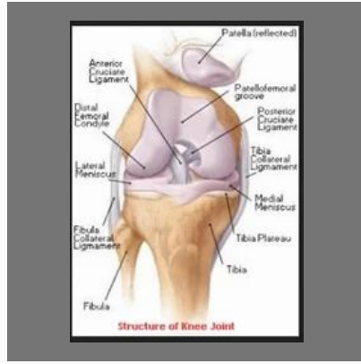
Orthopedics Treatment Service