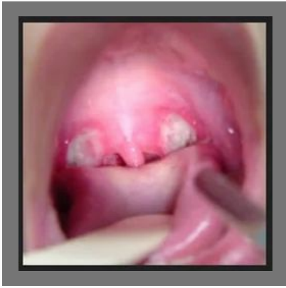
Pediatrics Treatment Service