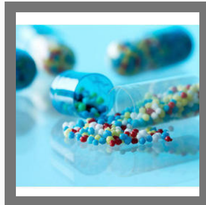
Pharma Franchise In Chhatarpur