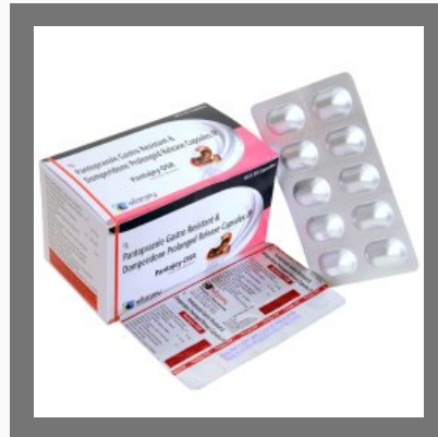
Pantoprazole Gastro Resistant and Domperidone Prolonged Release Capsules