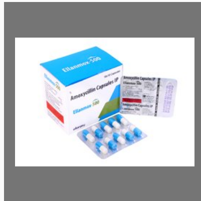
Amoxicillin 500 mg Capsules