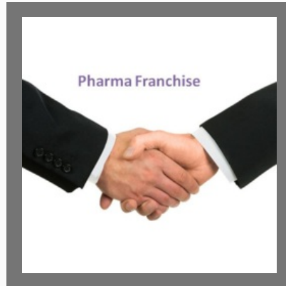
Pharma Franchise In Begusarai