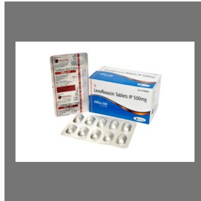
500 mg Levofloxacin Tablets IP