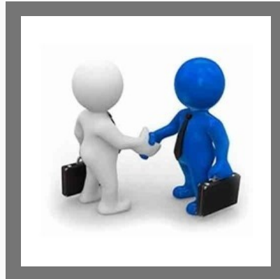
Pharma Franchise In Baran