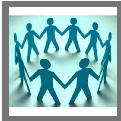
Pharma Franchise In Satara