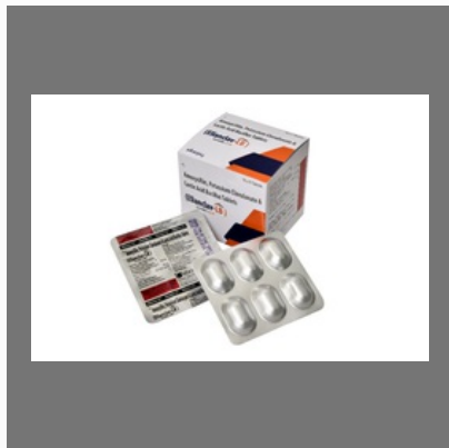
Amoxicillin And Potassium Clavulanate And Lactic Acid Bacillus Tablets