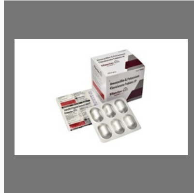
Amoxicillin And Potassium Clavulanate Tablets IP