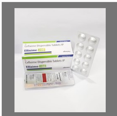
Cefixime Dispersible Tablets