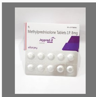
Methylprednisolone 8 mg Tablets