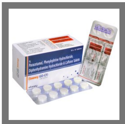
Snowy GO-CF Tablets