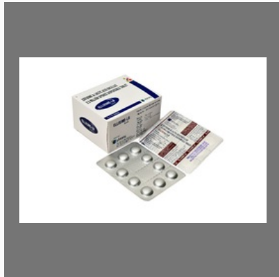
Cefixime And Lactic Acid Bacillus 2.5 Billion Dispersible Spores Tablet