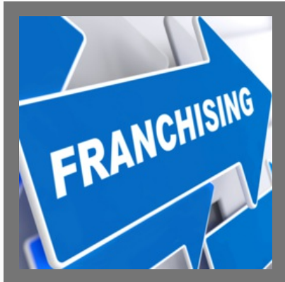
Pharma Franchise In Bundi