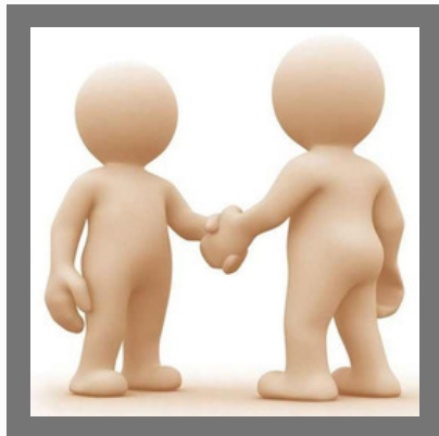
Pharma Franchise In Guna