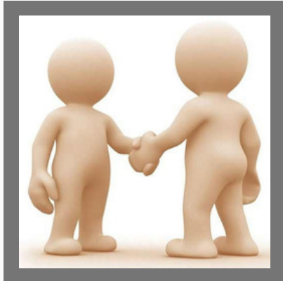
Pharma Franchise In Alwar