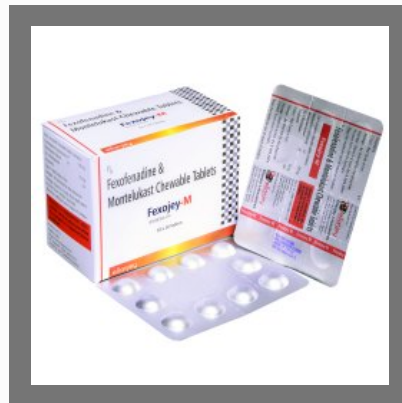
Fexojevy M Tablets