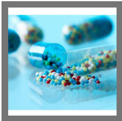
Pharma Franchise In Buldhana