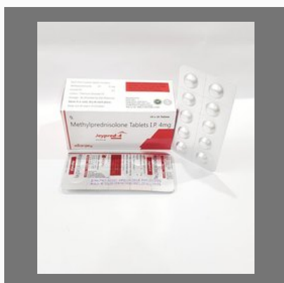
Methylprednisolone 4 mg Tablets