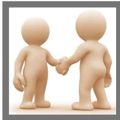
Pharma Franchise In Amravati