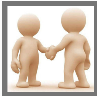
Pharma Franchise In Bahraich