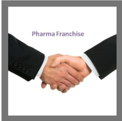
Pharma Franchise In Annupur