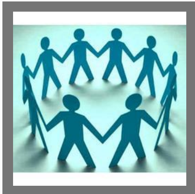
Allopathic PCD Pharma Franchise In Balrampur