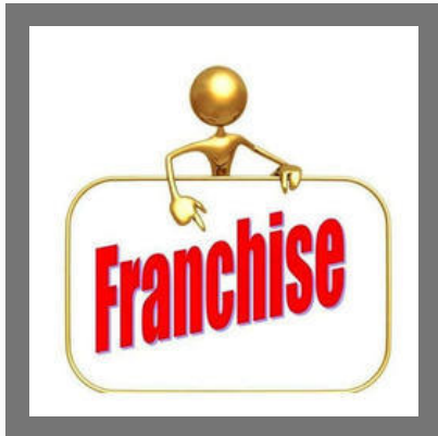
Pharma Franchise In Banka