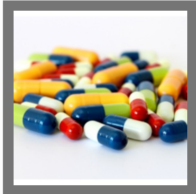
Pharma Franchise In Buldana