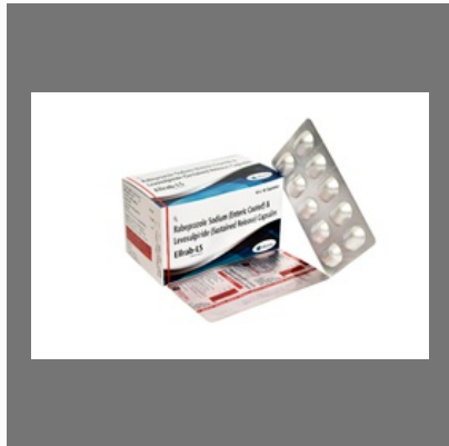
Rabepazole Sodium And Levosulpiride Capsules