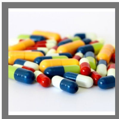
Pharma Franchise In Muzaffarnagar