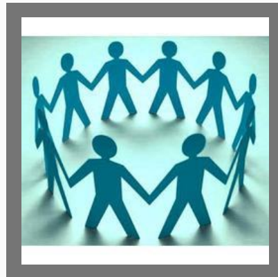
Pharma Franchise In Lakhesarai