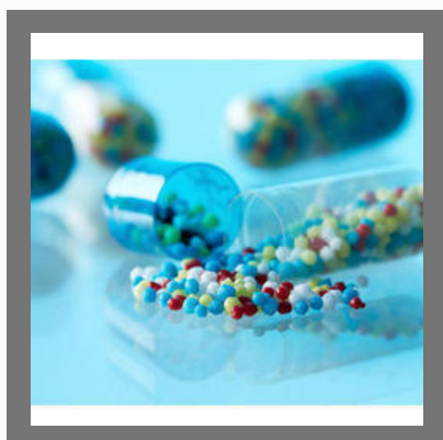
Pharma Franchise In Jehanabad