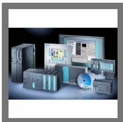
PLC Automation Service