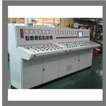
Automatic Machine Control Panel