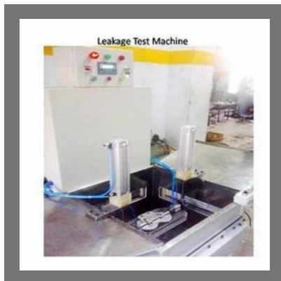
Leakage Testing Machine