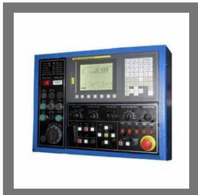
CNC Control Panel