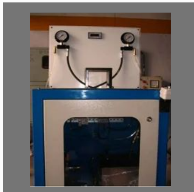
Pressure Testing Machine