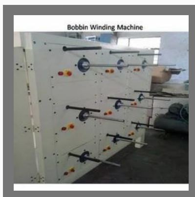
Bobbin Winder Machine