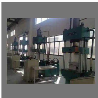
Hydraulic Pressing Machine