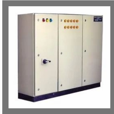
MCC Control Panel