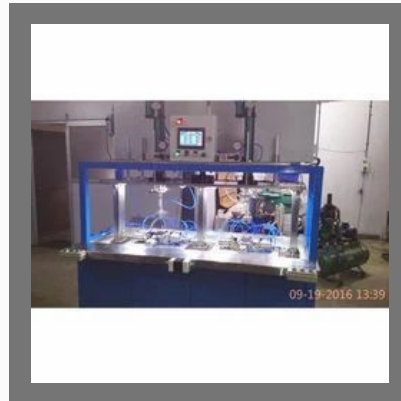
Valve Testing Machine