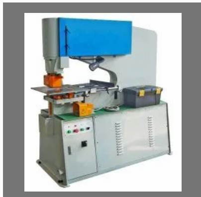
Hydraulic Punching Machine