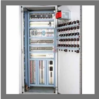
PLC Control Panel