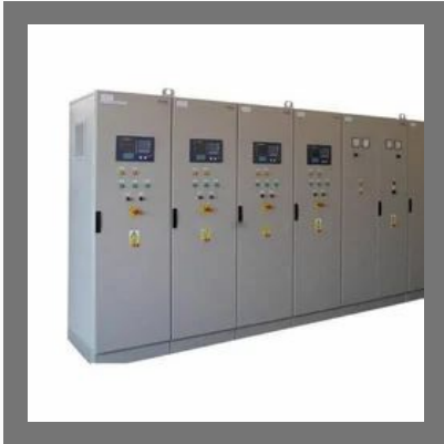
Electric Control Panel