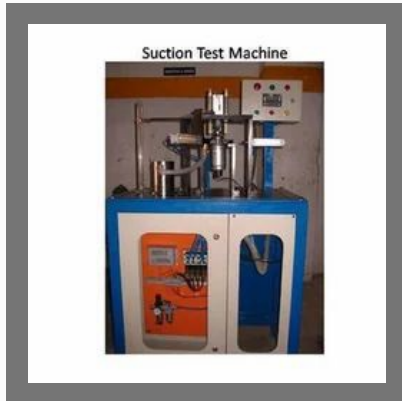
Suction Testing Machine