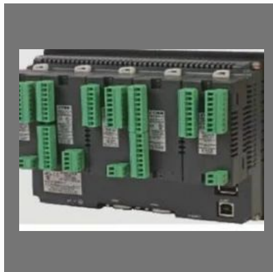
Programmable Logic Controller