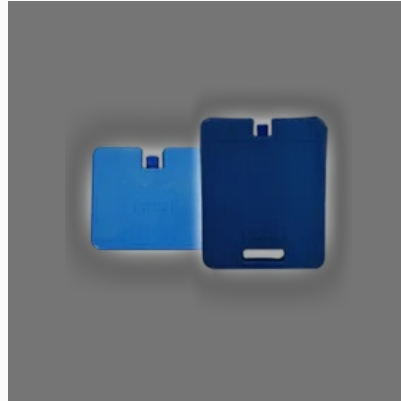
Non Disposable Hdpe Ice Pad