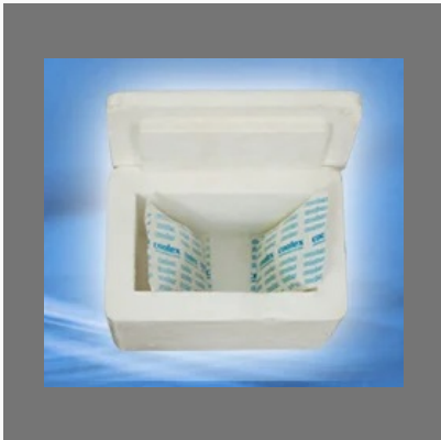
Disposable Gel Ice Pack