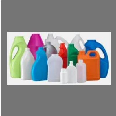
Plastic HDPE Oil Jars