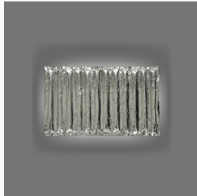
Gourmet And Catering Equipment