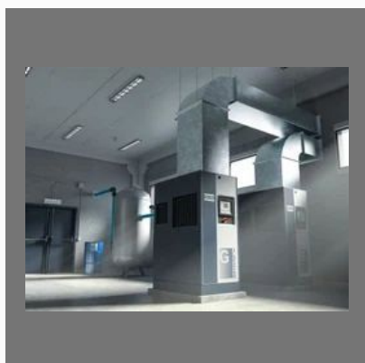
Atlas Copco Air Compressors