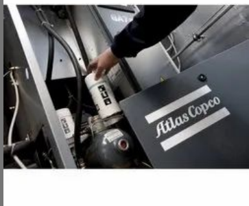
Air Compressor Maintenance Service