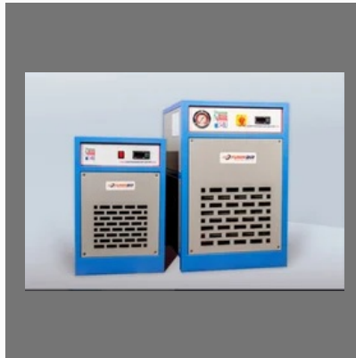
Refrigerated Compressed Air Dryer