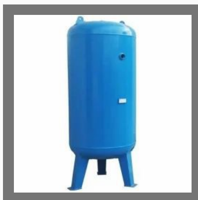
Air Receiver Storage Tank