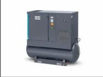
G 7-11 Oil Injected Screw Air Compressors