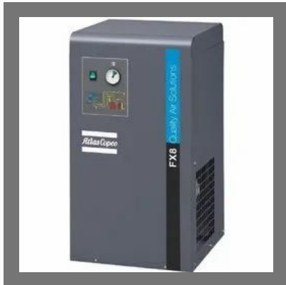
Refrigerated Air Dryer