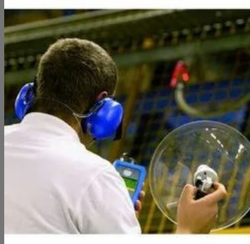
Compressed Air Audit Service