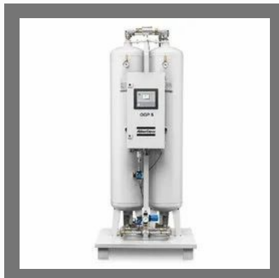
OGP 5 PSA Oxygen Generators