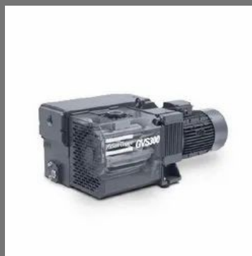
Single Stage Oil Sealed Rotary Vane Vacuum Pumps