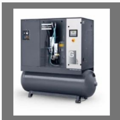
Industrial Air Compressors