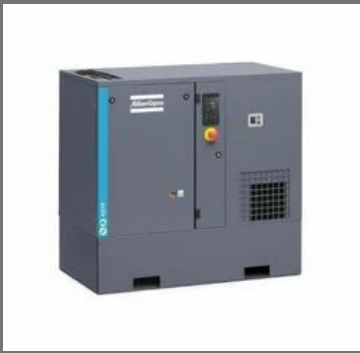
Atlas Copco Air Compressors 2Kw/3Hp