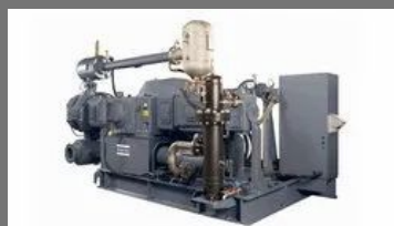
High Pressure Air Compressor