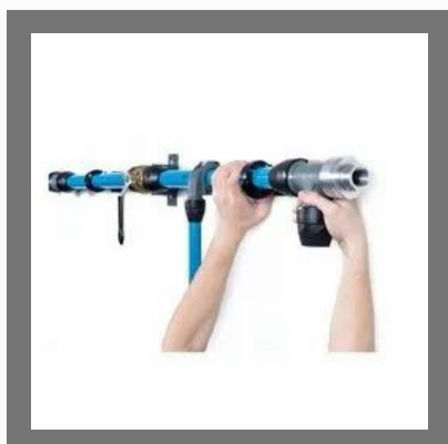
Compressed Air Piping System