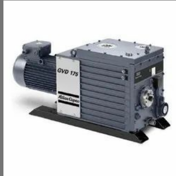
2 Stage Oil Sealed Rotary Vane Vacuum Pumps