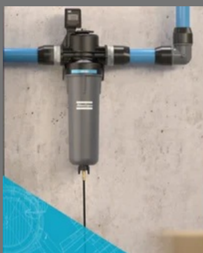
Air Compressor Accessories