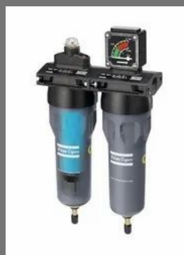
Atlas Copco Air Compressor Oil and Dust Filter