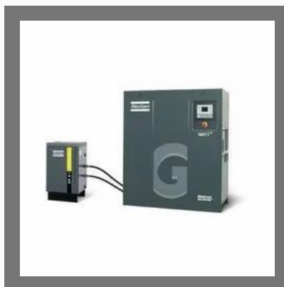
GA 11 Plus Heat Recovery For Air Compressor