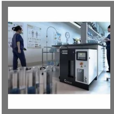
SF Oil Free Scroll Air Compressors