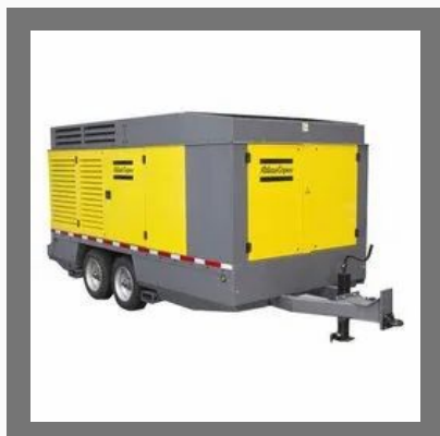
Air Compressor Rental Service