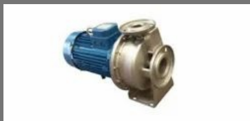
High Pressure Centrifugal Pump