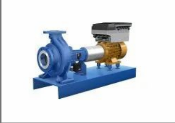
Industrial Ksb Pump