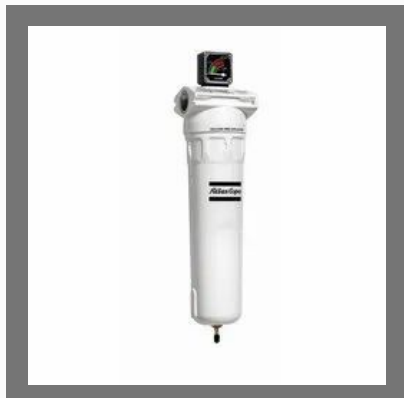
Silicone Free Compressed Air Filters