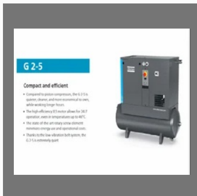
Atlas Copco G2-5 Air Compressor