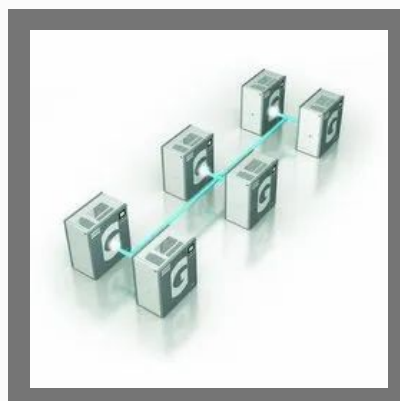
Air Compressor Monitoring System