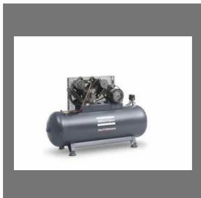
Piston Air Compressors