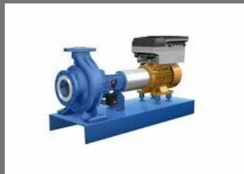
Ksb Centrifugal Pump