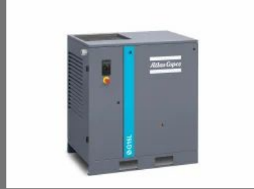
Ga 15 Atlas Copco Screw Air Compressors