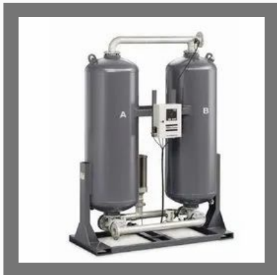
CD 2 Heatless Desiccant Air Dryer