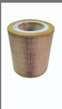
Air Filter For Atlas Copco Compressor