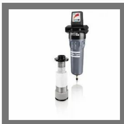
UD Coalescing Compressed Air Filters