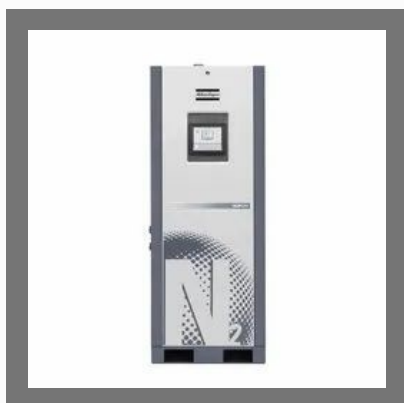
NGP PSA Nitrogen Gas Generators