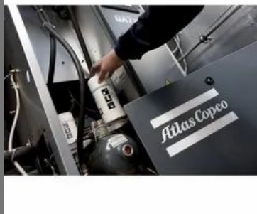
Air Compressor Repairing Service