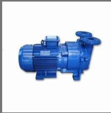
Liquid Ring Vacuum Pumps