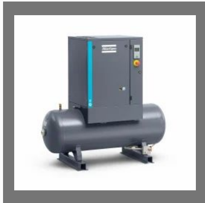
G 2-5 Oil Injected Tank Mounted Rotary Screw Air Compressors