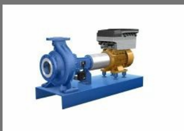
Single Stage Centrifugal Pump