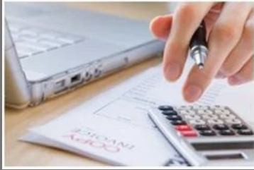
Income Tax Consultancy