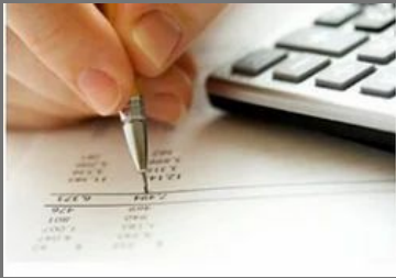
Investment Advisory Services