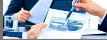
Company Registration Services