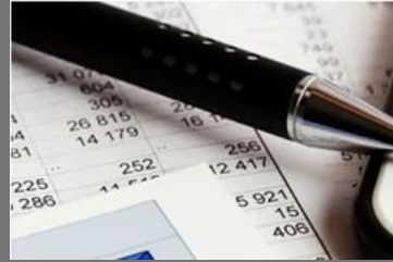
Service Tax Consultancy