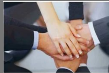
NGO Societies Trust