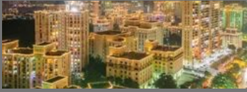
Real Estate Services