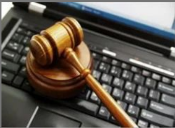
Company Law Services