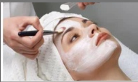
Skin Care Course