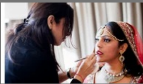
Bridal Make Up Course