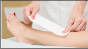
Hair Removal Course