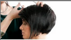
Femail Short Haircut Course