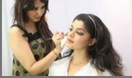
Party And Red Carpet Course