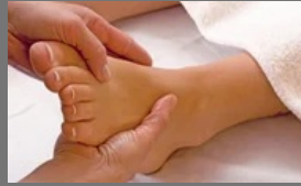
Hands And Feet Care Course