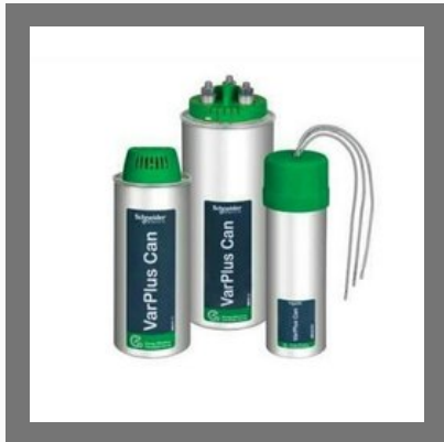
Varplus Can Gas Filled Heavy Duty Capacitors