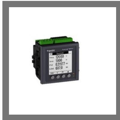
Smart Demand Controller