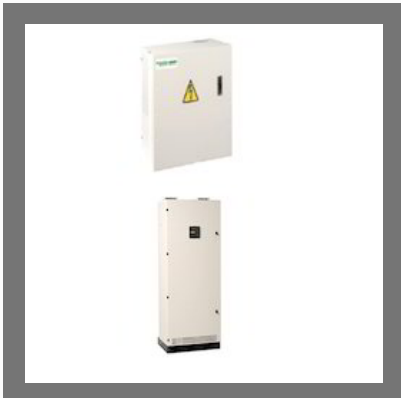
Transient Free Capacitor Banks