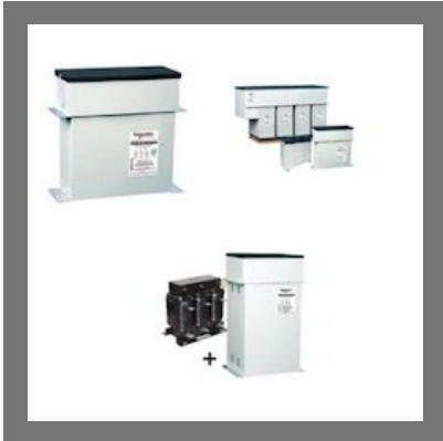
Lv Steel Box Capacitors