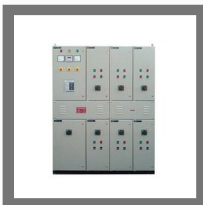
Electrical Board Metering Panel