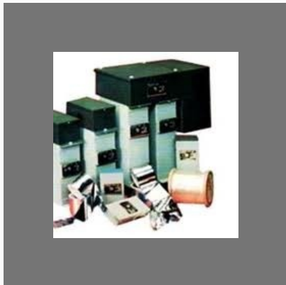
Low Tension Capacitor