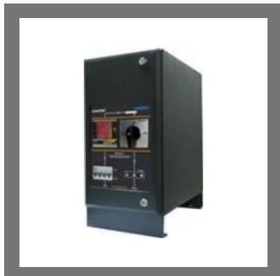
Coolite Lighting Energy Saver Upto 120kva