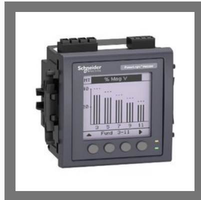
Load Manager Energy Meter