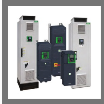
AC Drive Panel