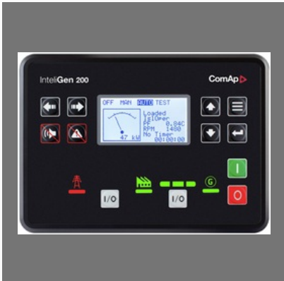
Auto Synchronising Relay