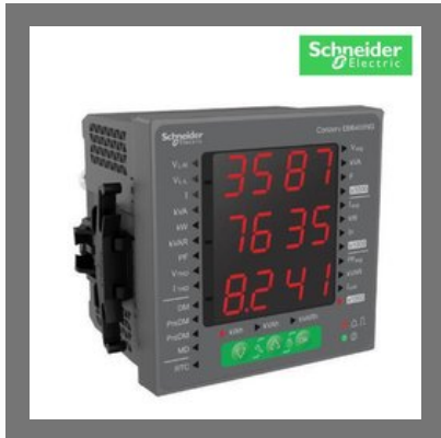
Multi Function Energy Meter