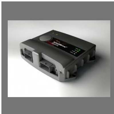
Engine Controllers for Pumps, Compressors, Excavators