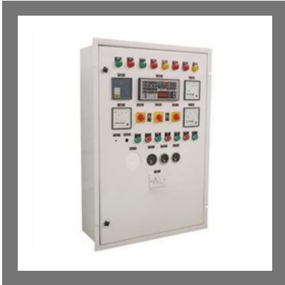
Generator Control Panel