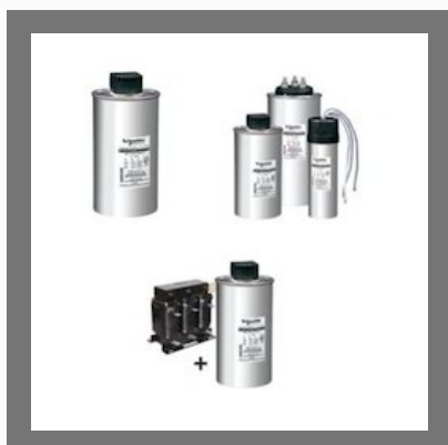
LV Aluminum Can Capacitors