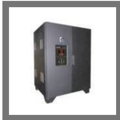
Coolite Lighting Energy Saver Above 120KV