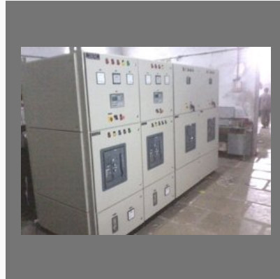
DG Synchronization Panel