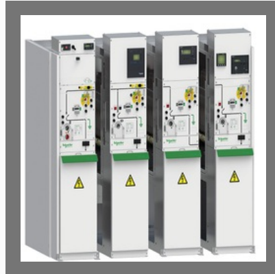
Mv Capacitor Banks Energy