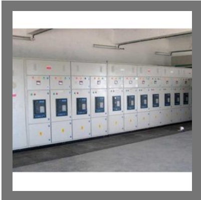
Power Control Center