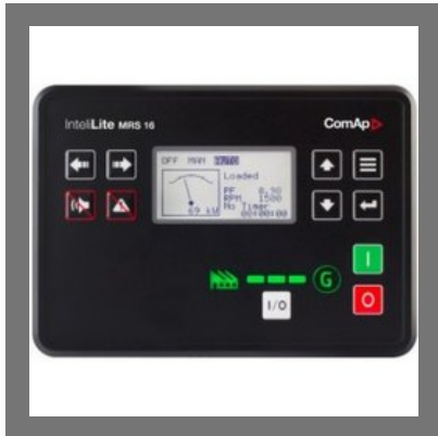
Generating Set Controller