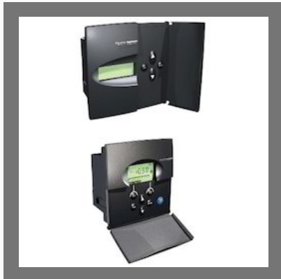
Varlogic N Power Factor Controller