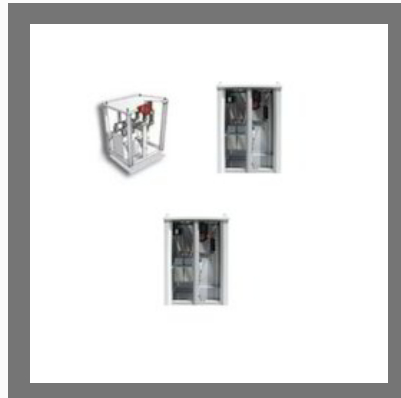
Mv Capacitor Banks Industry