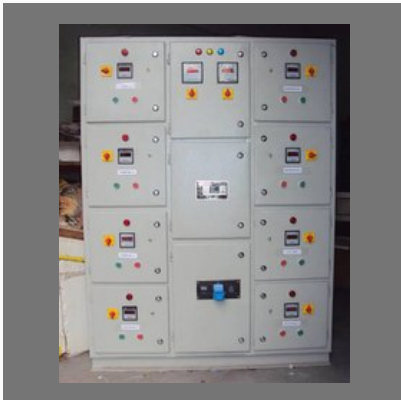
Motor Control Centre