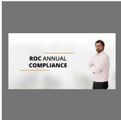
ROC Compliance Service