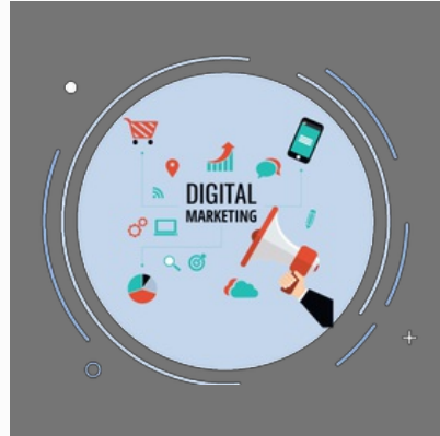
Digital Marketing Services