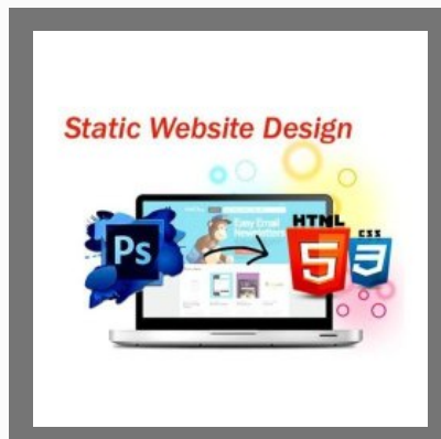
Static Website Development Service