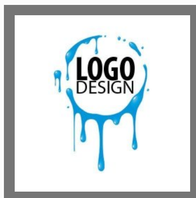
Dynamic Logo Designing Service