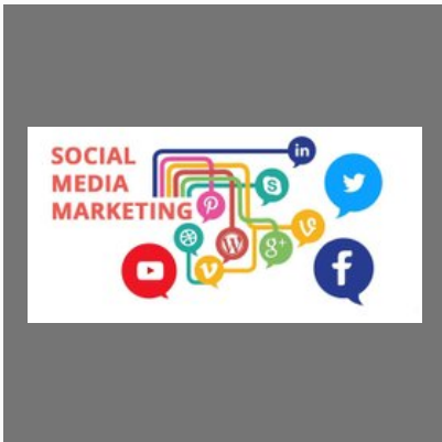
Social Media Marketing Service