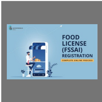
Food License Registration Service