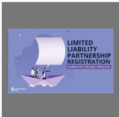
5-7 Working Days Limited Liability Partnership Registration Service