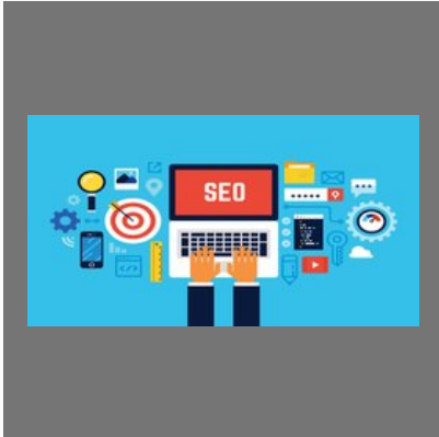
Search Engine Optimization Services