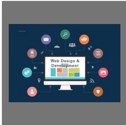
Dynamic Web Designing Service