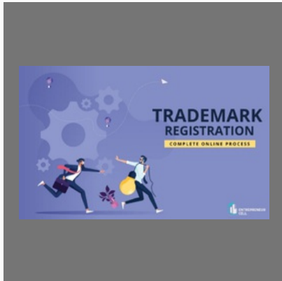
Trademark Registration Service