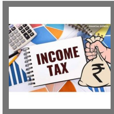
ITR Filing Service