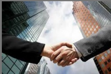
Merger & Acquisitions