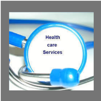
Health Care Services