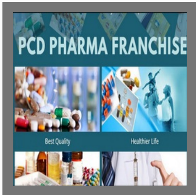
Allopathic PCD Pharma Franchise In Assam