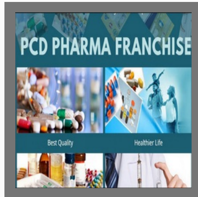
Allopathic PCD Pharma Franchise in Rajasthan