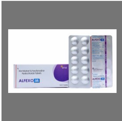
PCD Pharma Franchise In India