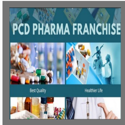
Pharma Franchise In India