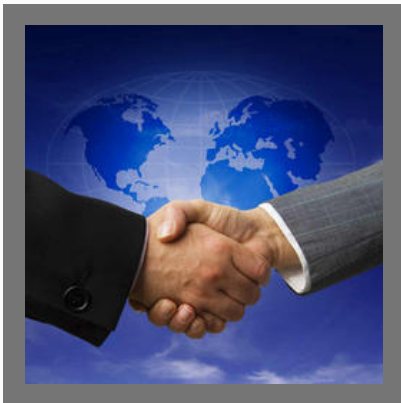
Pharmaceutical Third Party Manufacturing