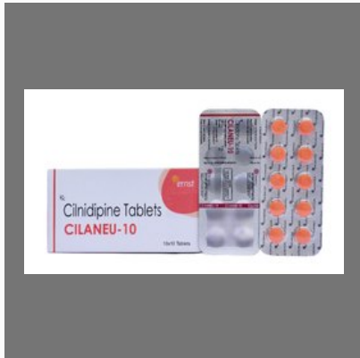
Pharma Franchise In GOA