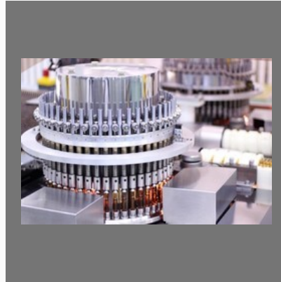
Pharmaceutical Third Party Manufacturing