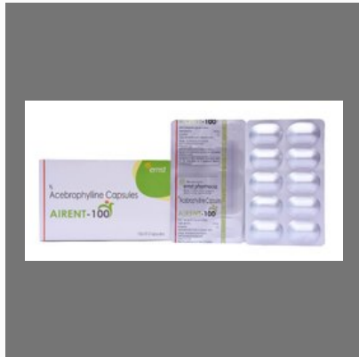
Allopathic PCD Pharma Franchise