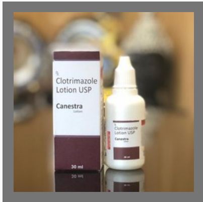
Pharma Franchise In ORISSA