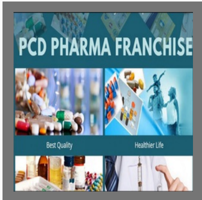
Pharma Franchise In Madhya Pradesh