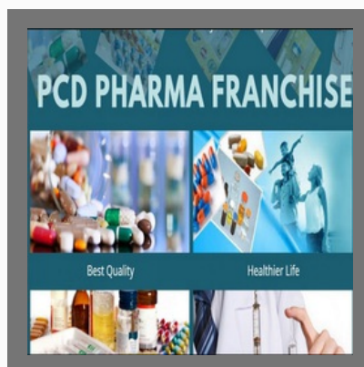
Pharma Franchise In Gujrat