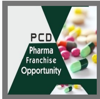
PCD Pharma Franchise in Tamil Nadu