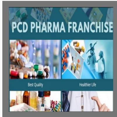
Allopathic PCD Pharma Franchise In Madhya Pradesh