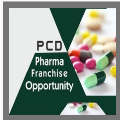
Allopathic PCD Pharmaceuticals Franchise In Jammu