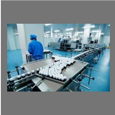
Pharmaceutical Contract Manufacturing Services