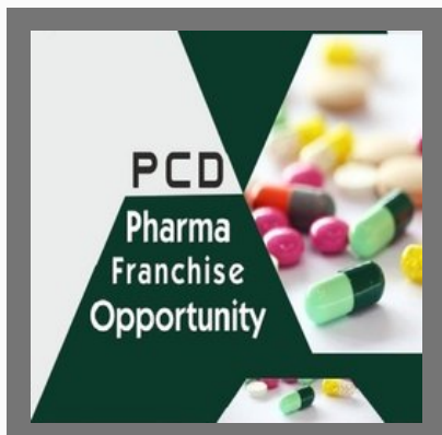
Allopathic PCD Pharmaceuticals Franchise In Sikkim