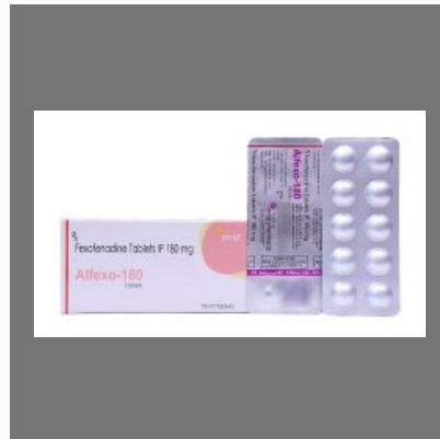
PCD Pharma Franchise In Kerala