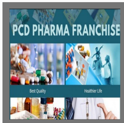
Allopathic PCD Pharma Franchise In Sikkim