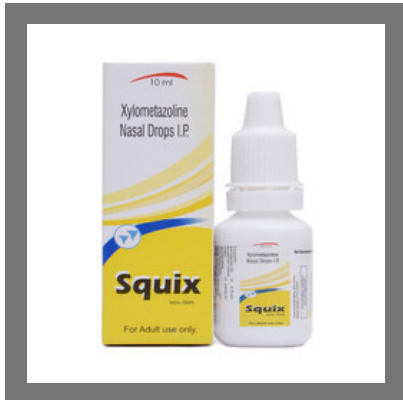
Squix Nasal Drop