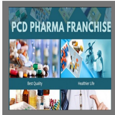
Pharma Franchise In Assam