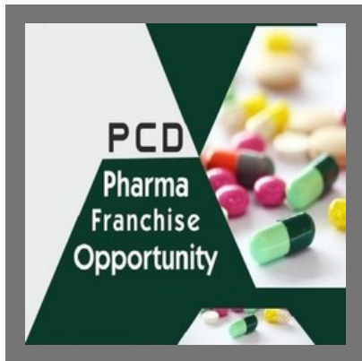
Allopathic Pharmaceutical Franchise in Madhya Pradesh