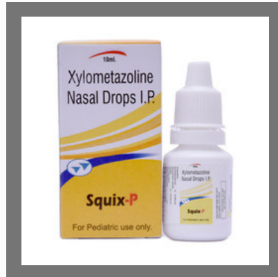
Squix P Nasal Drop