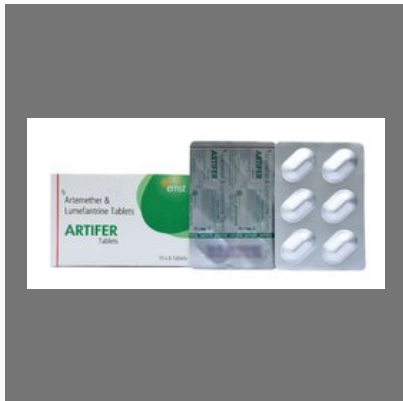
PCD Pharma Franchise In Rajasthan