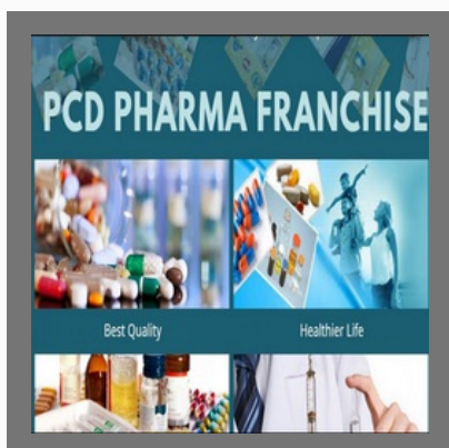
Allopathic PCD Pharma Franchise in Kashmir