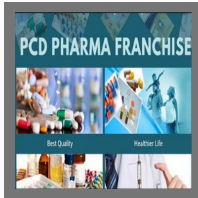
Allopathic PCD Pharma Franchise In Gujrat