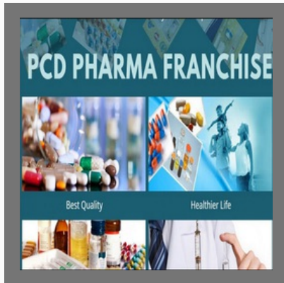
Allopathic PCD Pharma Franchise in Goa