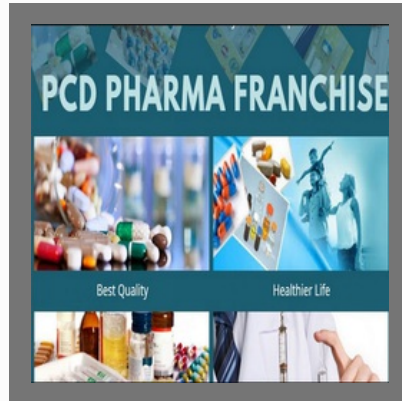
Allopathic PCD Pharma Franchise in Uttarpradesh