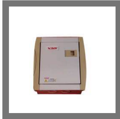
Double Door Top Line MCB Box