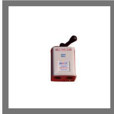
Reverse Forward Switch