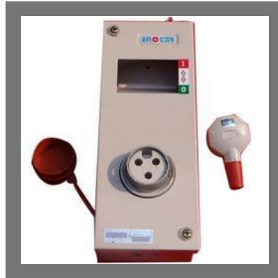
AC Box TPN 20/30 AMP