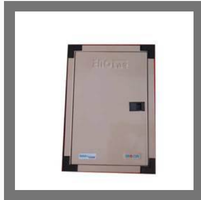
TPN Double Door Super Line MCB Box