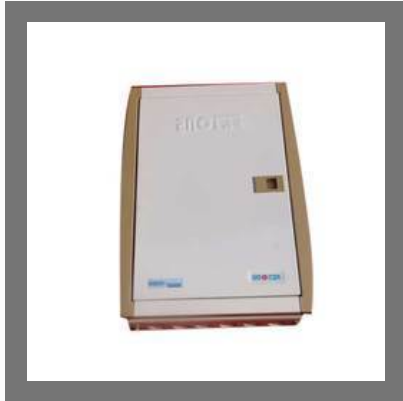
TPN Double Door Top Line MCB Box