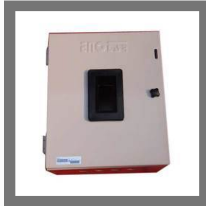
100 AMP MCCB Box