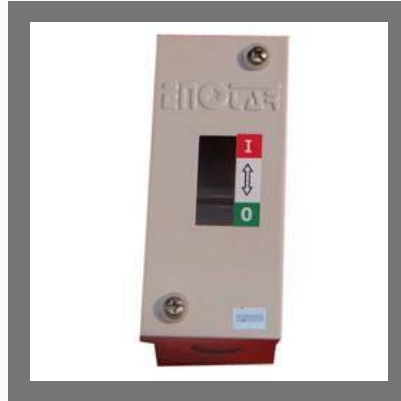
One Pole Box