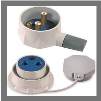
Metal Clad Plug Socket