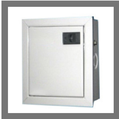
MCB Distribution Board