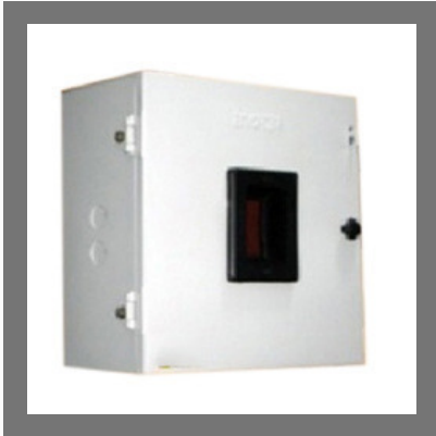
MCCB Distribution Box