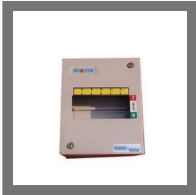
Single Door DB Box