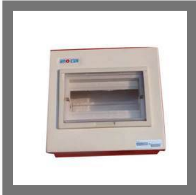
DB Box White Line MCB Distribution Board