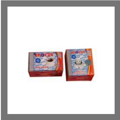
Metal Clad Plug Socket