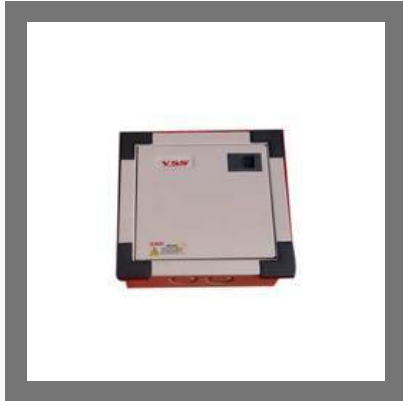
Double Door Super Line MCB Box