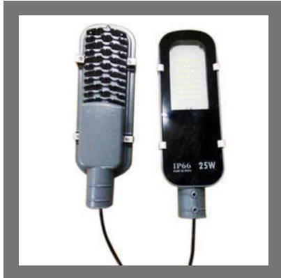
25W LED Street Light