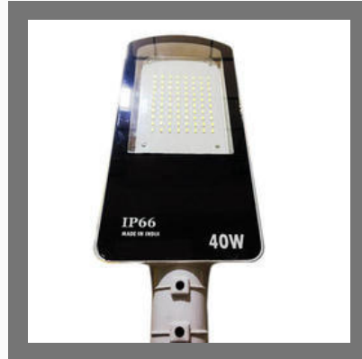
40W LED Street Light