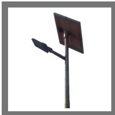
50W Su-Kam Solar Lighting