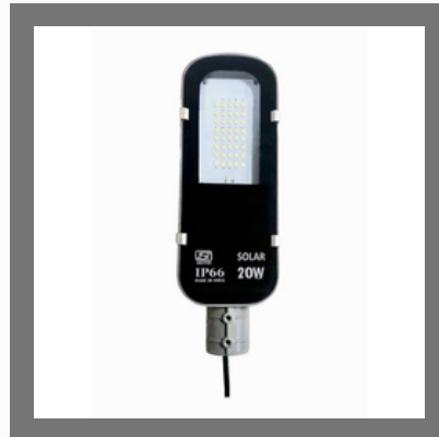
20W Solar LED Street Light