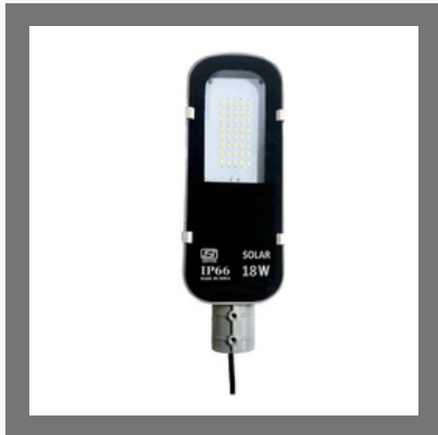
18W Solar LED Street Light