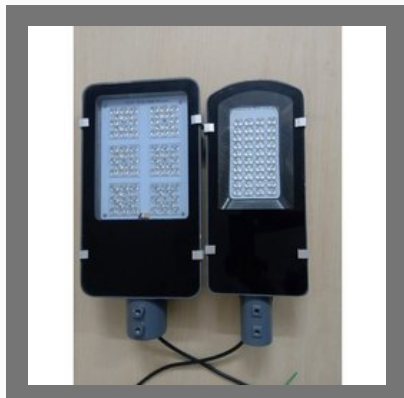
Semi-Integrated Solar Street Light