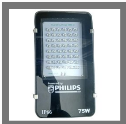
75W LED Street Light