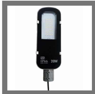
20W LED Street Light