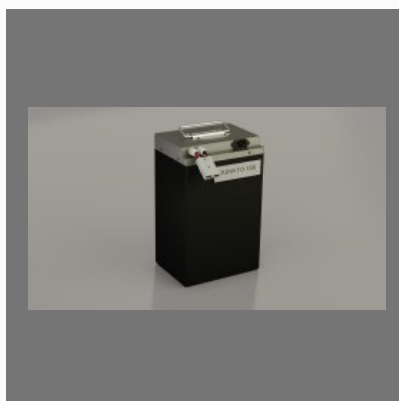
Sumatotek - 72V Lithium Ion Ev Battery Pack