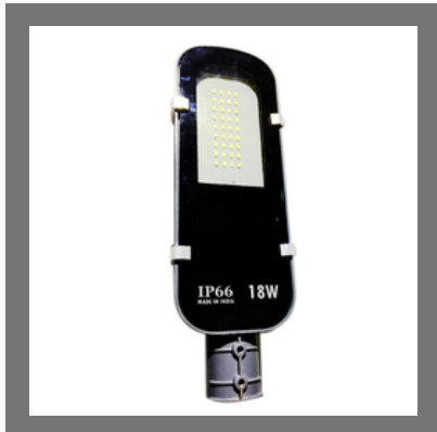
18W LED Street Light