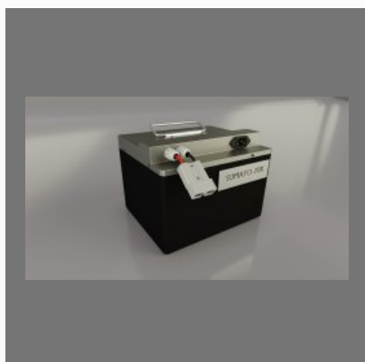
Sumatotek - 60V Lithium Ion EV Battery Pack