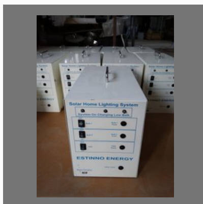
Solar Home Light Kit