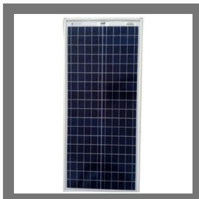
Integrated Solar LED Street Light