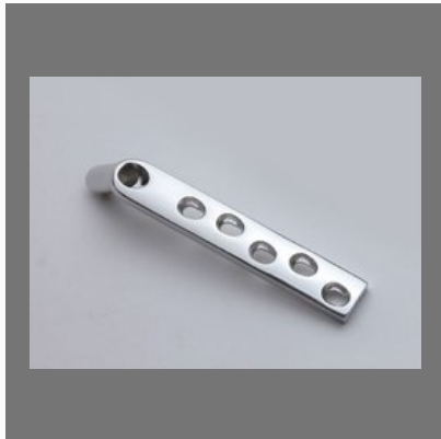
DHS Barrel Plate