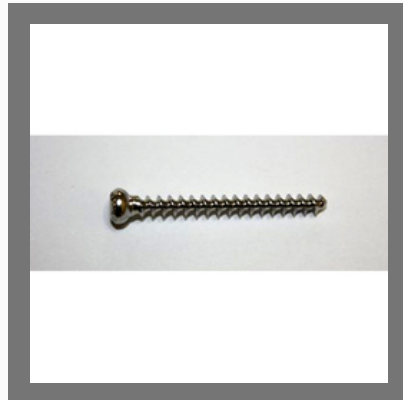
3.5mm Cancellous Screws