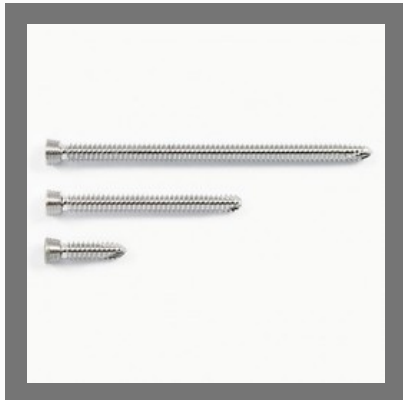
3.5 mm Cortical LCP Screw