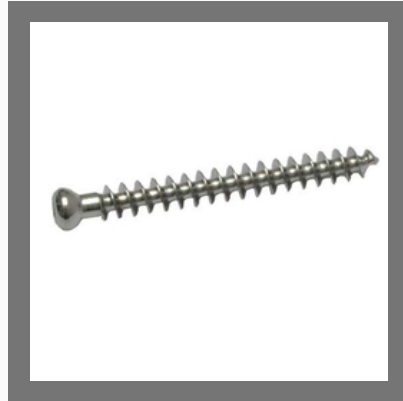
4 mm Cancellous Screws