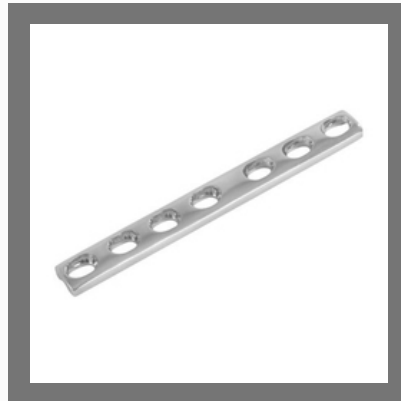
DCP Small Plate