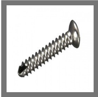
3.5 Mm Cortical Bone Screws