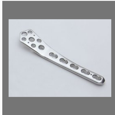
Distal Femur Locking Plate