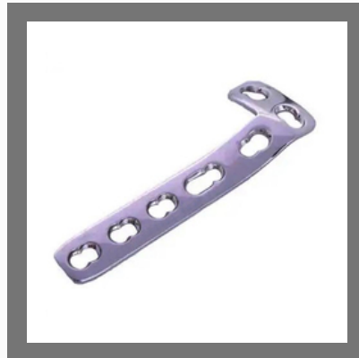
Orthopedic L Buttress Plate