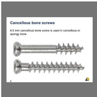
6.5 mm Cancellous Bone Screw