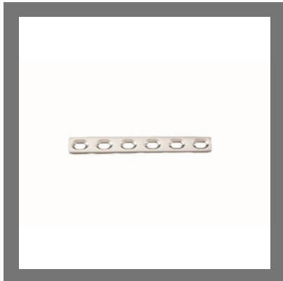
LCDC Bone Plate