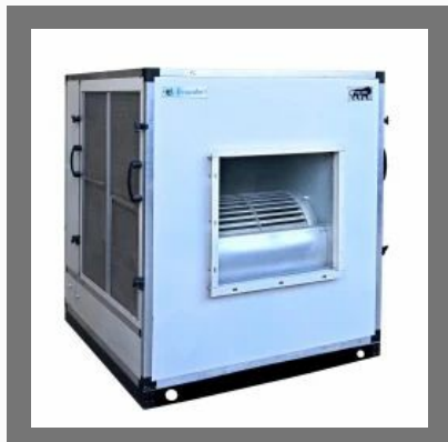
Industrial Ductable Cooler