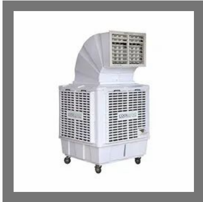
Industrial Mobile Cooler