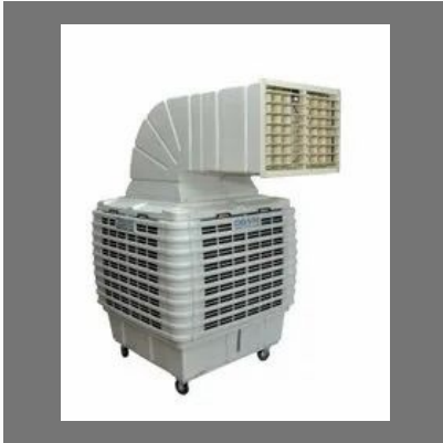
Industrial Evaporative Portable Cooler