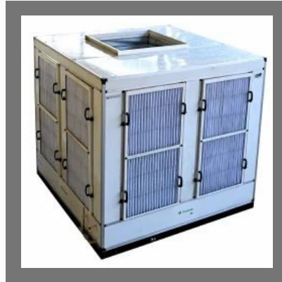
Industrial Air Cooler