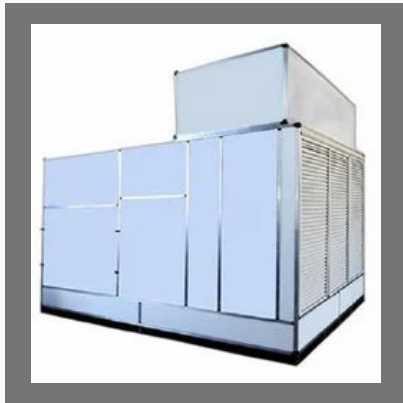
Coolator 25- Indirect Evaporative Air Cooler