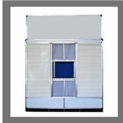
Coolater 17-Industrial Evaporative Air Cooler