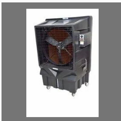
EVAPOLER WK-90 K