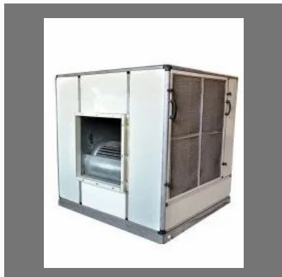
High Static Industrial Cooling Unit