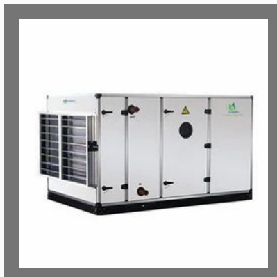
Evapoler Floor Mounted Horizontal AHU