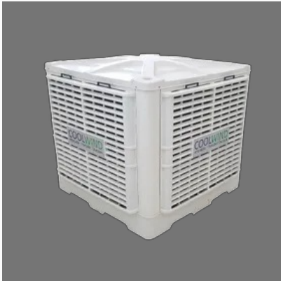
Duct Air Cooler