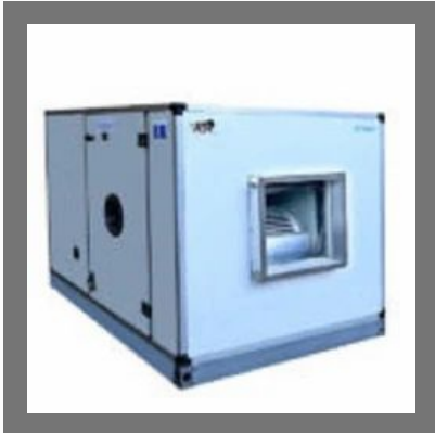
Evapoler EVA -AWS-510