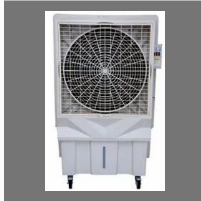
Industrial Portable Cooler