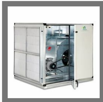
Evapoler Industrial AHU