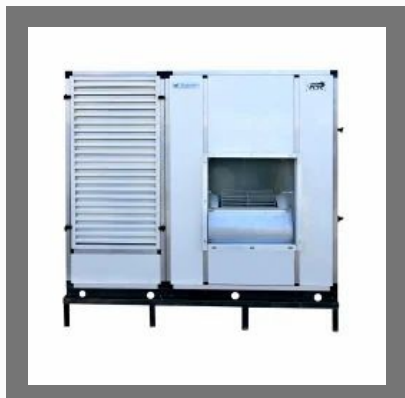
Hybrid Air Conditioning