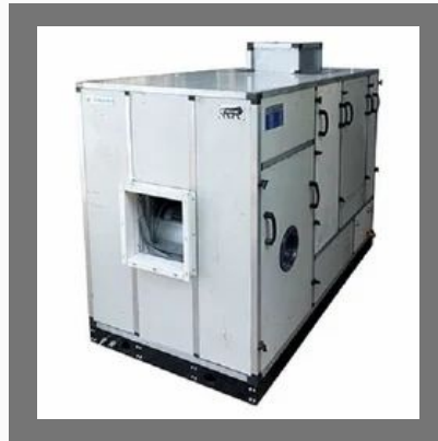
Coolator - 8 Indirect Evaporating Cooler