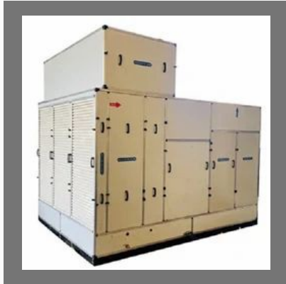
Evapoler Coolator 34 - Industrial Evaporative Air Cooler