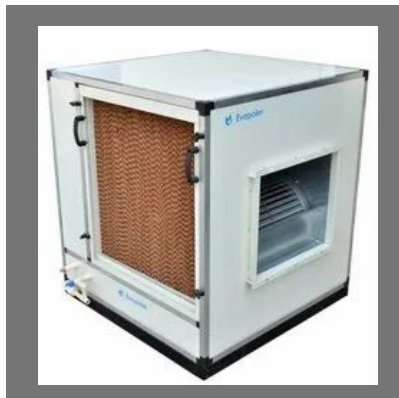
Industrial Air Cooler