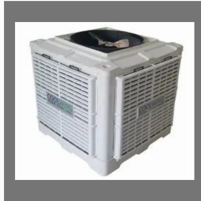
Ductable Evaporative Air Cooler