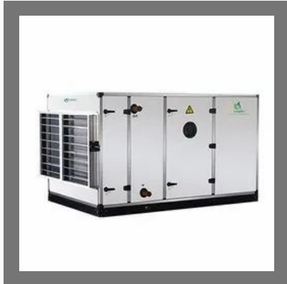
Air Handling Unit