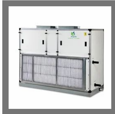
Evapoler Vertical Type Air Handling Unit