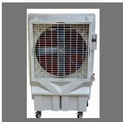
EVAPOLER WK-180 K