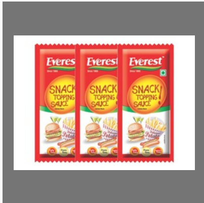
Everest Snack Topping Sauce