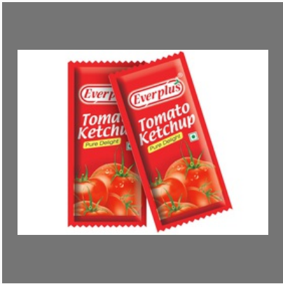
Everplus Tomato Ketchup