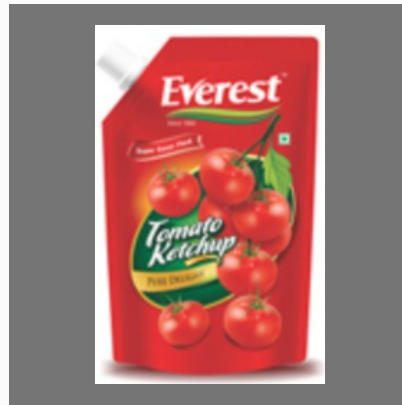
Everest DOY Pack Tomato Ketchup