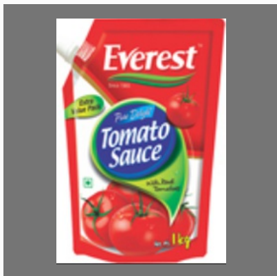
Everest Tomato Sauce