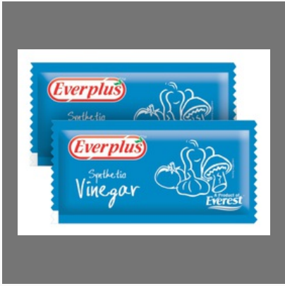
Everplus Synthetic Vinegar