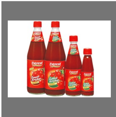
Everest Tomato Ketchup