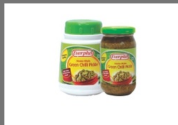
Everplus Green Chilli Pickle