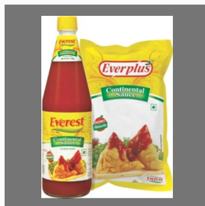
Everest Continental Sauce