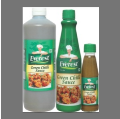
Everest Green Chilli Sauce