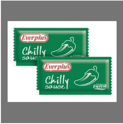
Everplus Chilly Sauce