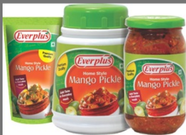
Everplus Mango Pickle