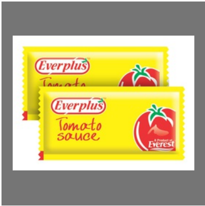
Everplus Tomato Sauce