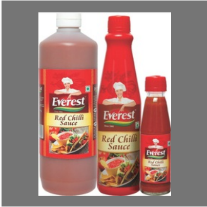
Everest Red Chilli Sauce