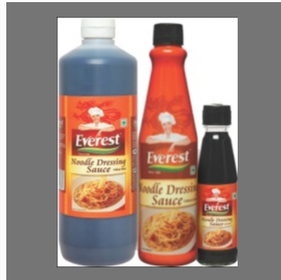
Everest Noodle Dressing Sauce