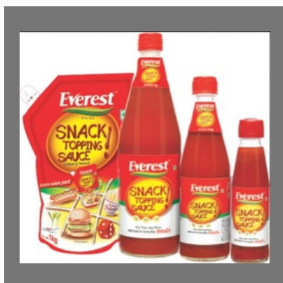
Everest Snack Topping Sauce