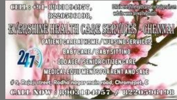
Care giver For elder patients in Chromepet