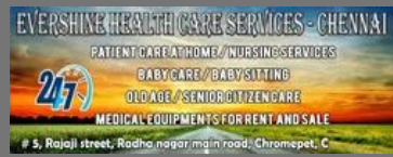
Care Taker Company