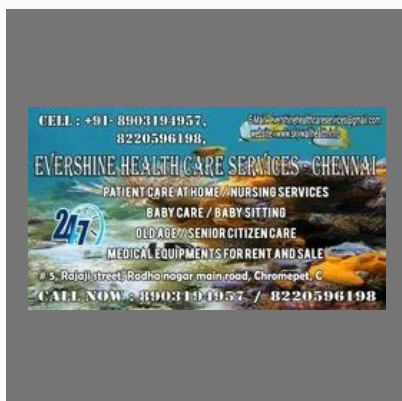
First aid at home in Chromepet