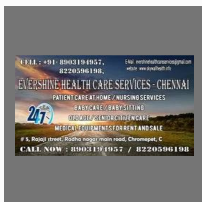
First aid in Chromepet