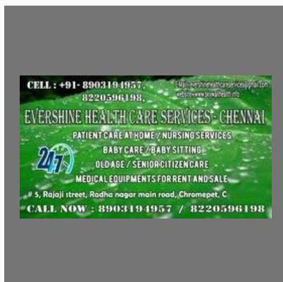
Care giver home nurse in Chromepet