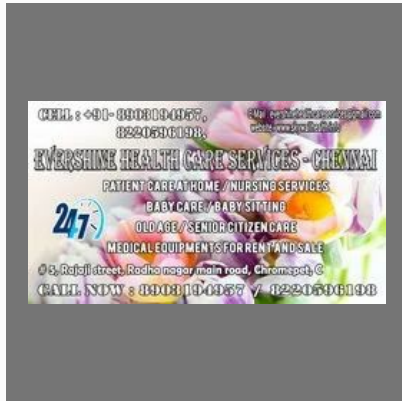
Care giver home care in Chromepet