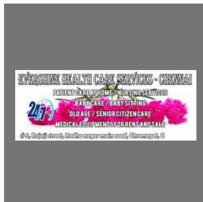
Care Taker Company