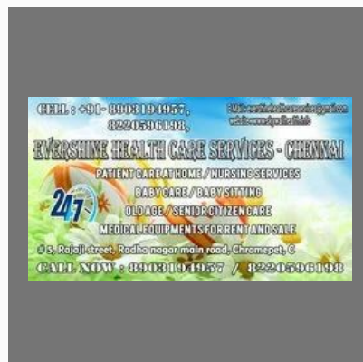
Care giver male nurse for home in Chromepet