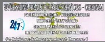
Care Taker Company