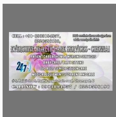
Care giver services in Chromepet