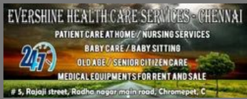
Care Taker Companies