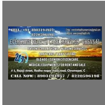
Care giver home nurse in Chromepet