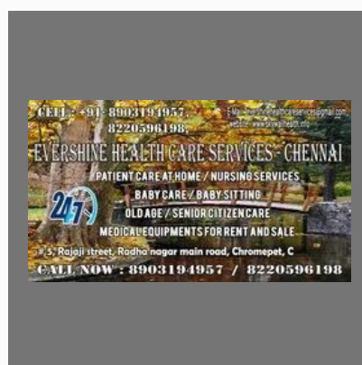
First aid after delivery in Chromepet