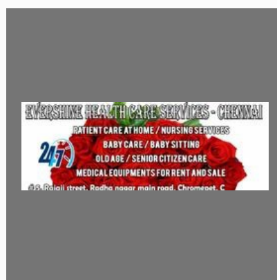
Care Giver For Elderly In