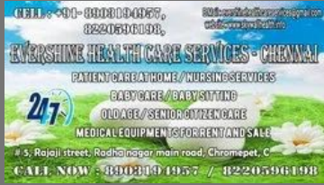
Care giver for bedded patients in Chromepet