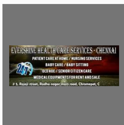
Care Giver Nurse Jobs