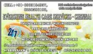
Care giver for surgery patient in Chromepet