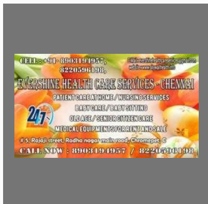
Care giver male nurse for home in Chromepet