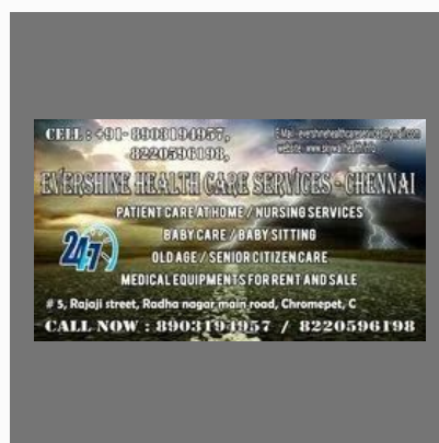
Care giver home health in Chromepet