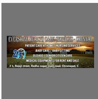
Care Giver Elderly In