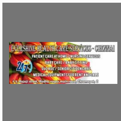
Care Taker After Delivery