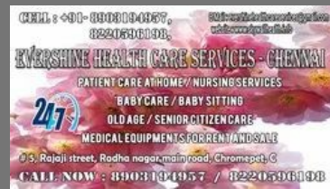
Care taker in Chromepet