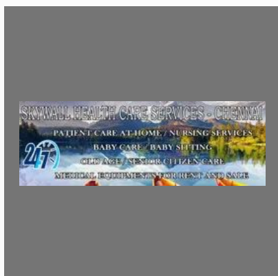
Health Care Service