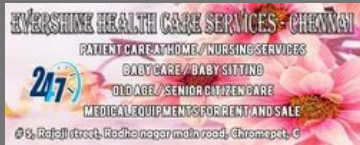
Care Taker Company