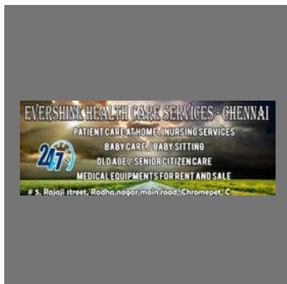
Care Taker Assistance