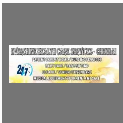
First Aid Agency