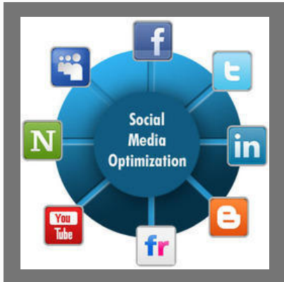
Social Media Optimization