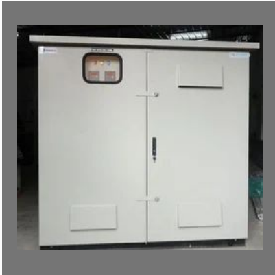
Outdoor MCC Panel