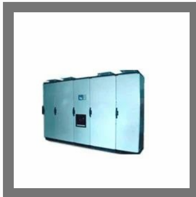
Energy Management System