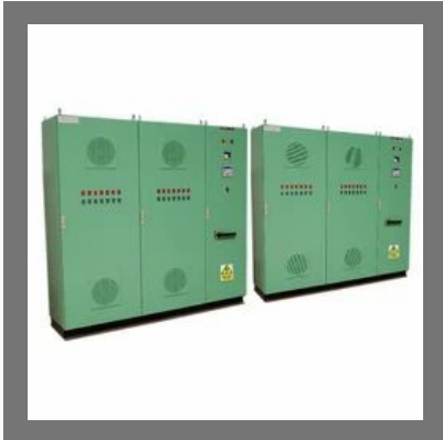
Automatic Power Factor Control Panel