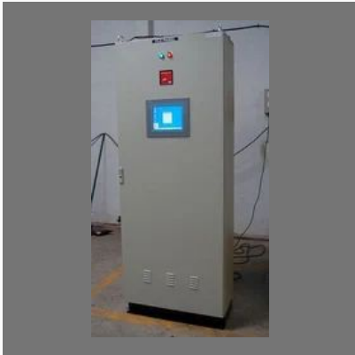
PLC Panel And ATS Panel