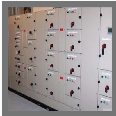
Motor Control Center (MCC)