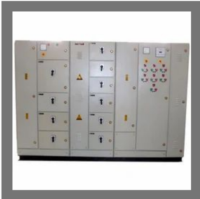
Automatic Capacitor Control Panels