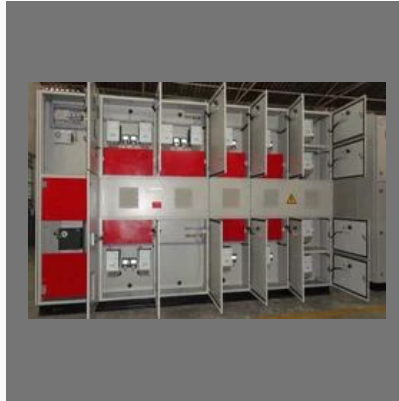
Thyristor Based Power Factor Correction Panel