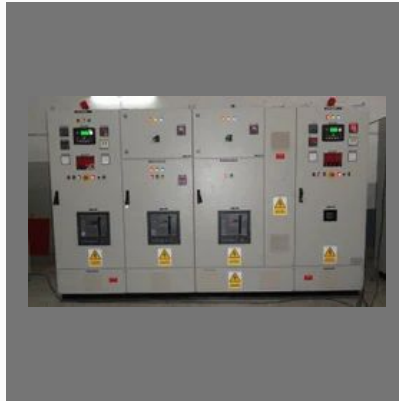
Auto Mains Failure Panel