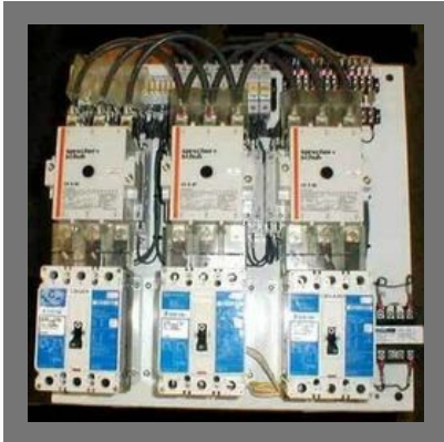
Power Management System