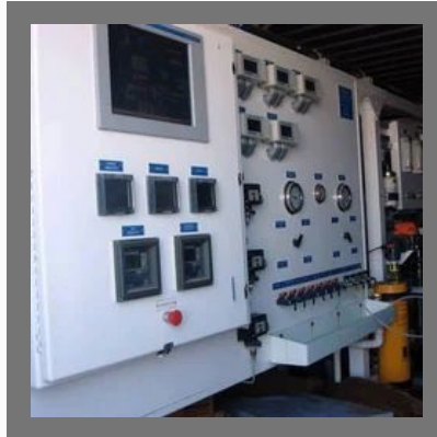
Supervisory Control And Data Acquisition (SCDA )