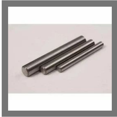
Tungsten Carbide Rod