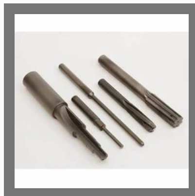
Solid Carbide Blanks