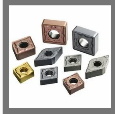
Carbide Turning Insert