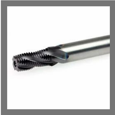
Carbide Thread Mills