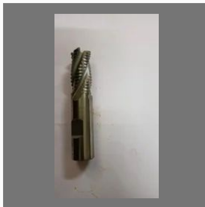
End Mill Drill Bits