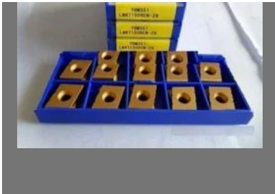
Zcc Carbide Insert