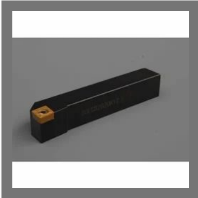
E Chain Holder