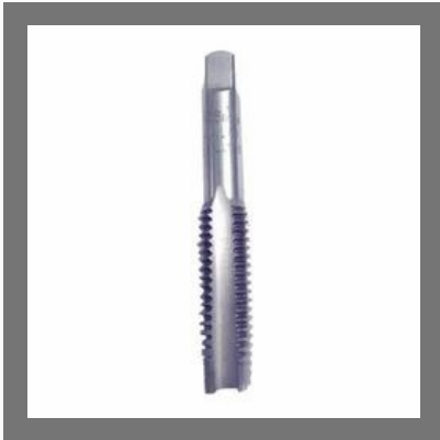
Thread Cutting Tool