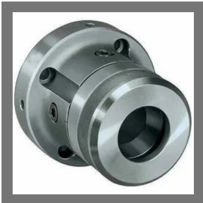
Collet Adaptors CNC