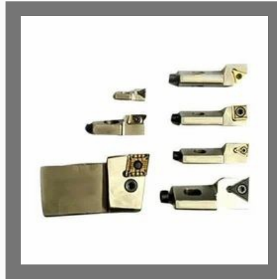
Cnc Collet Tools