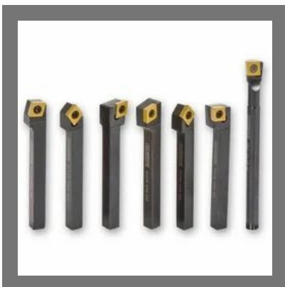
Turning Tool Spares