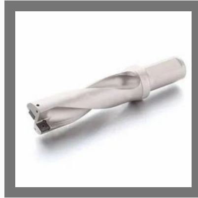
Tungsten Carbide Blanks