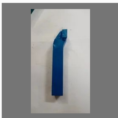
Carbide Tipped Tools