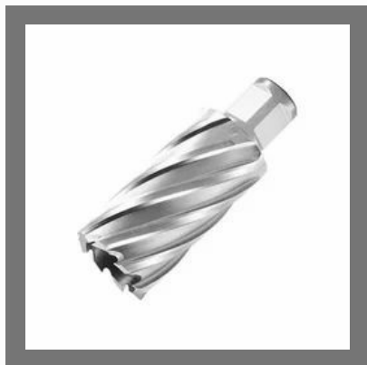
Tct Annular Core Cutters