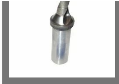
Korloy U Drills