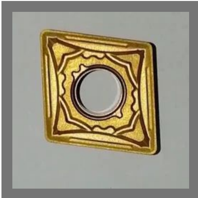
Tangaloy Carbide Inserts