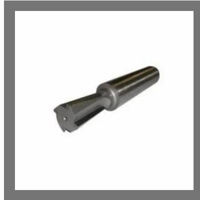
Brazed Carbide Reamers