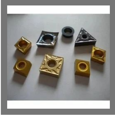
Cnc Turning Inserts