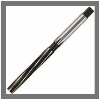
Hss Reamers Bits