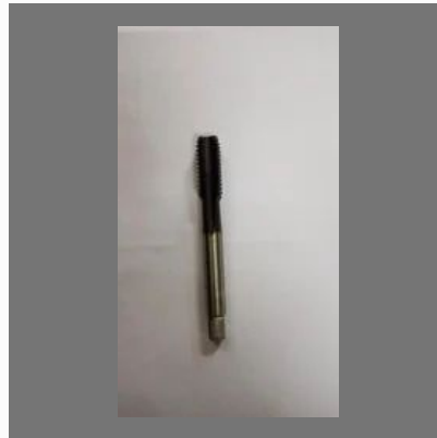
Hss Drill Bits