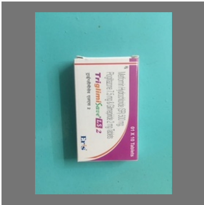
Triglimi Save Ls 2 Tablet