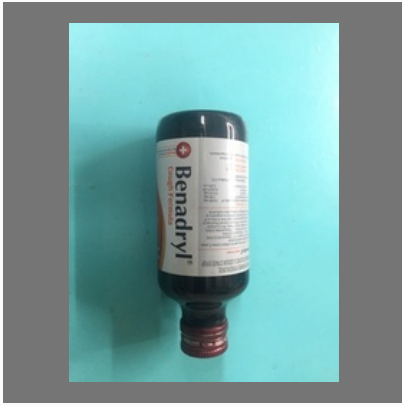
Benadryl Cough Syrup