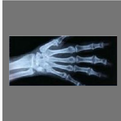
Hand Bone X-Ray Services