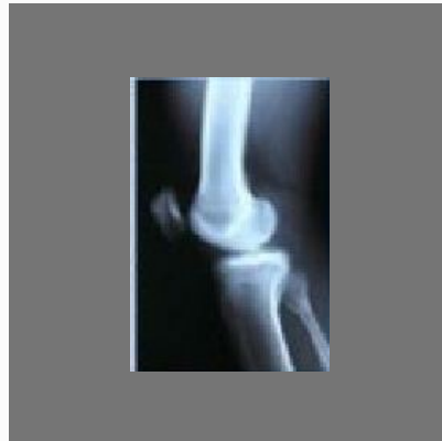
Leg Bone X-Ray Services