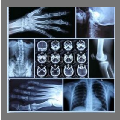
Digital X-Ray Services