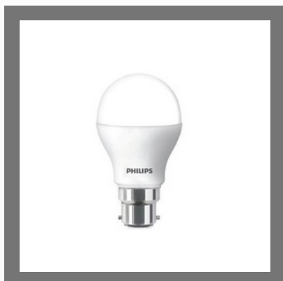
Philips LED Bulb