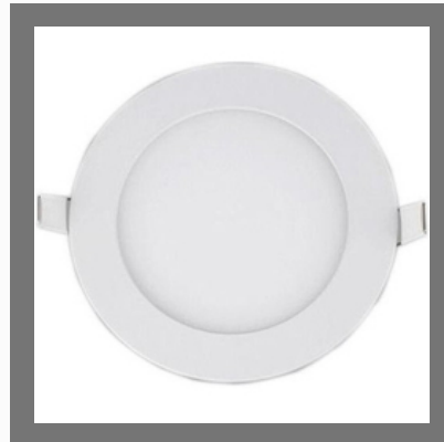
Round LED Panel Light