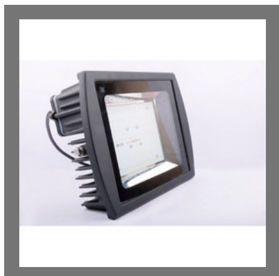
50W LED Flood Light