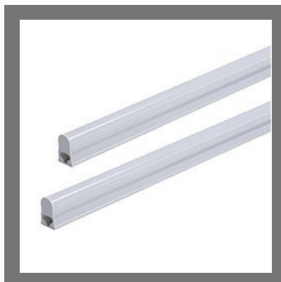
Chinese LED Tube Light