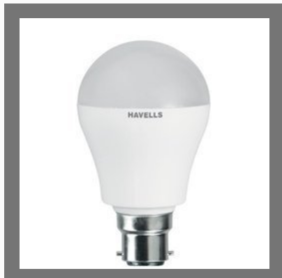
Havells LED Bulb