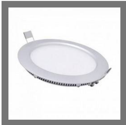
10W LED Panel Light