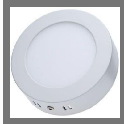
15W LED Panel Light