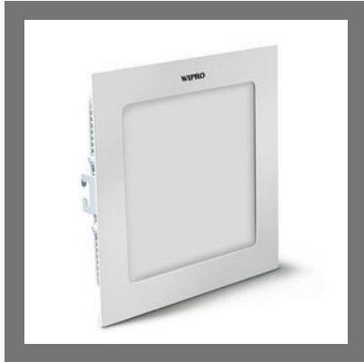
Wipro LED Panel Light