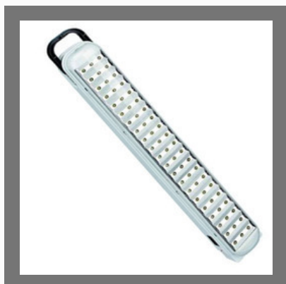
LED Rechargeable Light