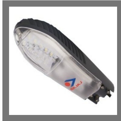
Bajaj LED Street Light