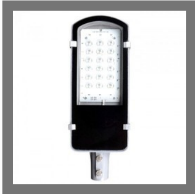
80W LED Street Light