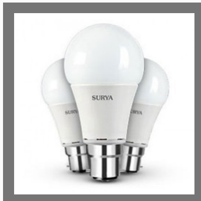
Surya LED Bulb