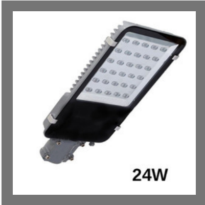
24W LED Street Light