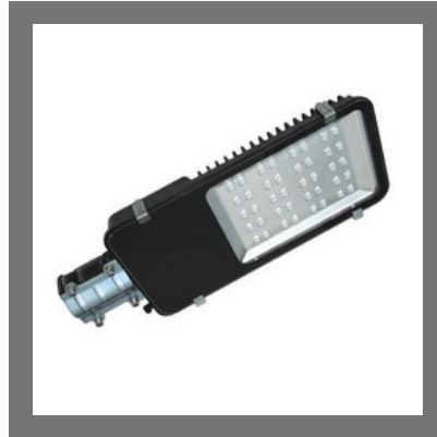
50W LED Street Light