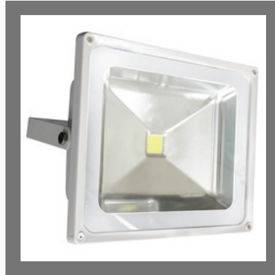
Square LED Flood Light