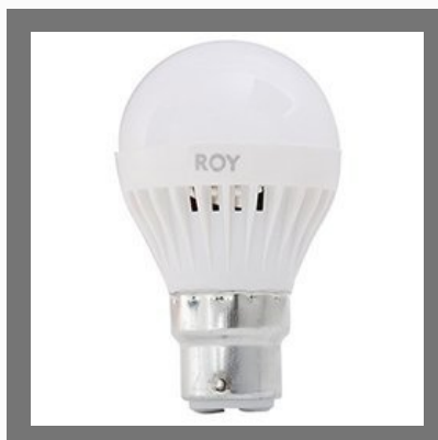
Roy LED Bulb