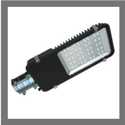
Outdoor LED Street Light