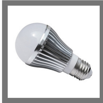
Chinese LED Bulb