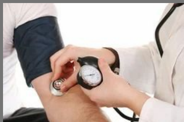
Annual Health Check-up