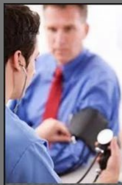
Pre-Employment Health Check-Up