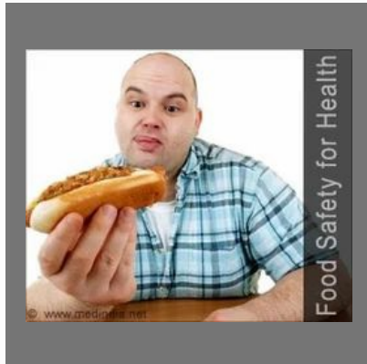
Food-Handlers Health Checkup