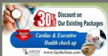
30% Discount On Cardiac And Health Check Ups