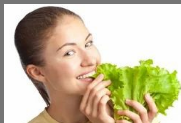
Weight Loss Programs