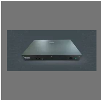
Matrix Epabx System