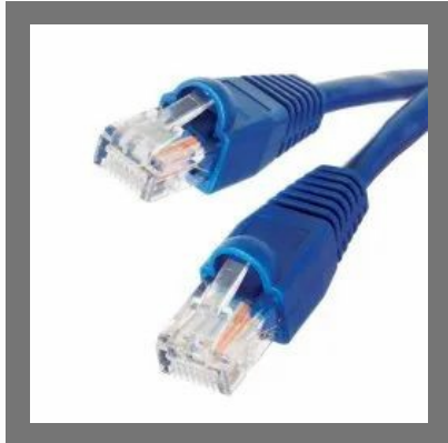
CAT5e LAN Cable