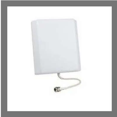
Patch Panel Antenna