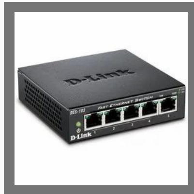
5 Port D Link Network Switch