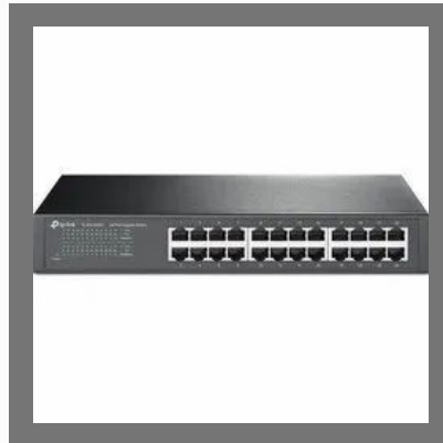
24Ports TP Link Network Switch