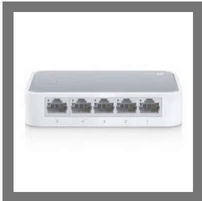
TP Link 5 Port Network Switch