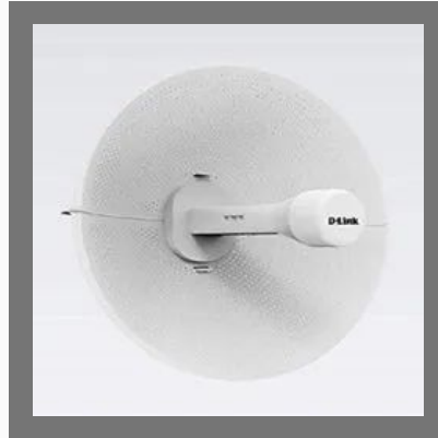
D-link Wireless Access Points