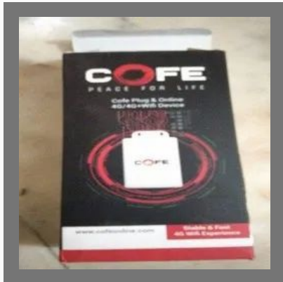
300 Mbps Wireless Router