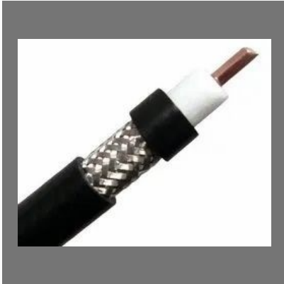
RF 400 Cable