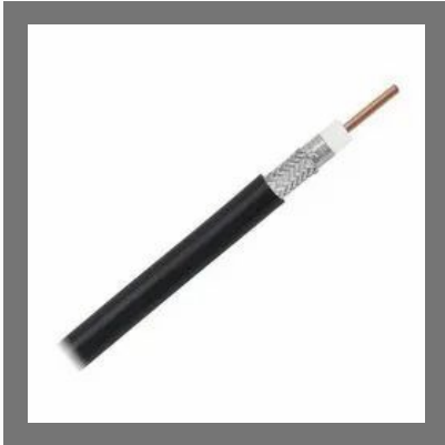
LMR 400 Cable