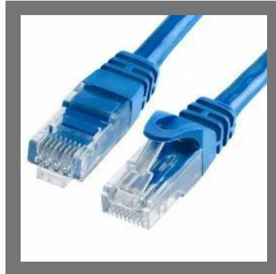
CAT6 LAN Cable