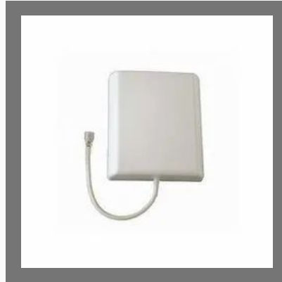
ABS Patch Panel Antenna