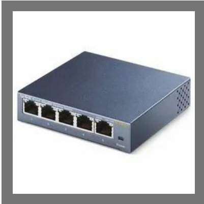
TP Link 5 Port Network Switch