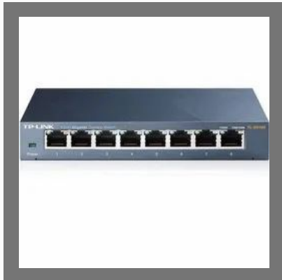
TL-SG108 V4 TP Link Network Switch