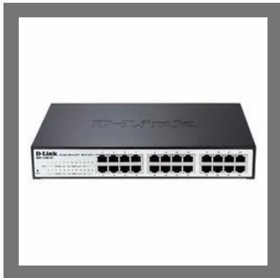
24 Ports D Link Network Switch