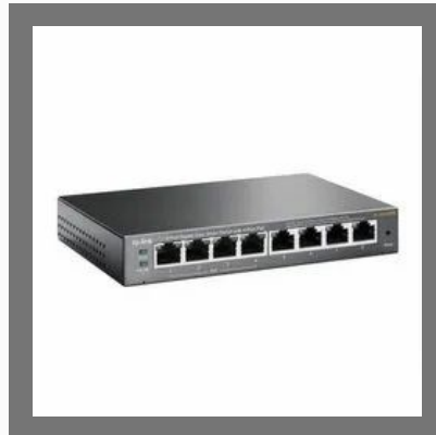
TL-SG108PE V2 TP Link Network Switch