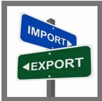
IE Code Registration Services