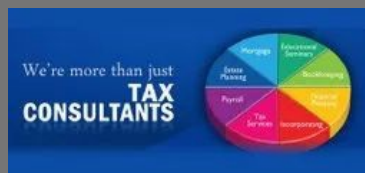
Income Tax Consultancy Services