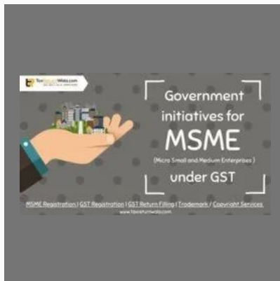
MSME Registration Services