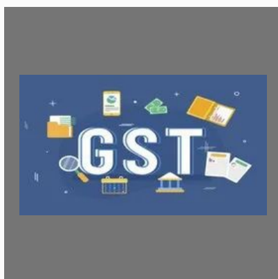
GST Return Services