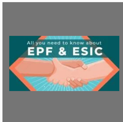
EPF ESIC Return Services