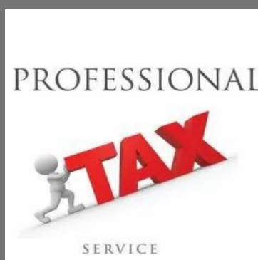
Service Tax Consultancy Services