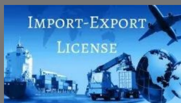
Import Export License Services