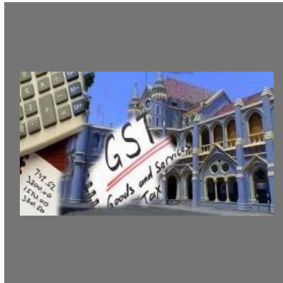
GST Registration Services