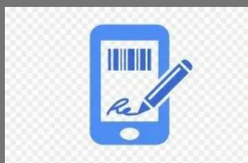
Class 3 Digital Signature Certification Services