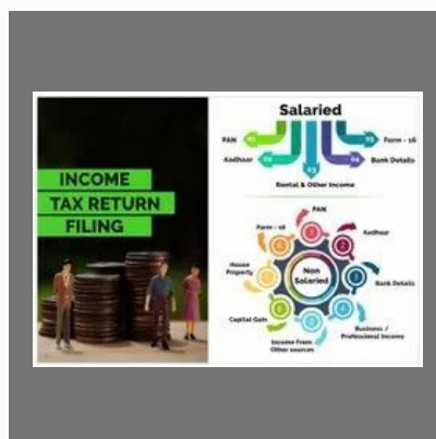
Income Tax Return Services