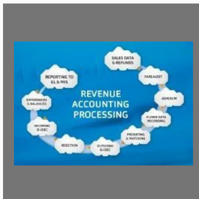
Revenue Accounting Services