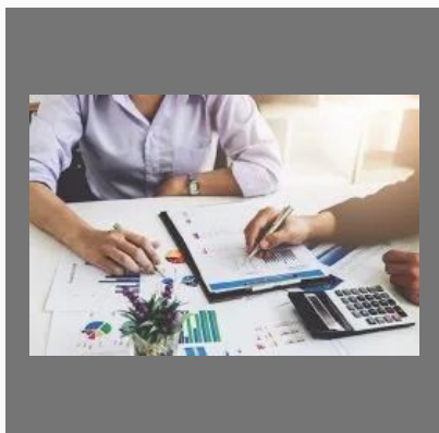
Business Accounting Services