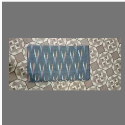
Pure Ikkat Cotton Fabric