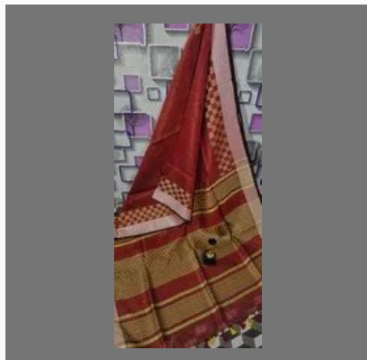
Linen By Linen Saree