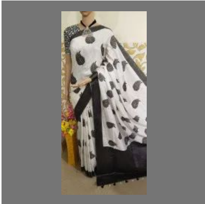
Hand Block Printed Cotton Saree