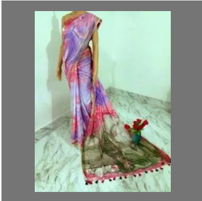
Ladies Tissue Linen Saree