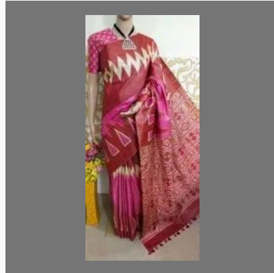
Katan Salab Hand Block Printed Saree