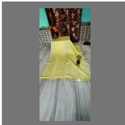
Katan silk staple dovi saree