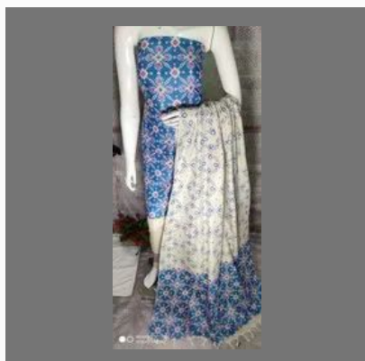
Cottan Dupion Suit