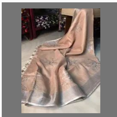
Cottan Salab Saree