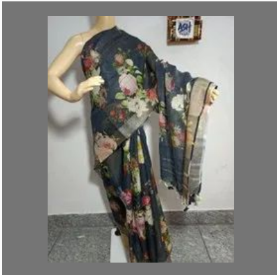
Party Wear Digital Printed Linen Saree