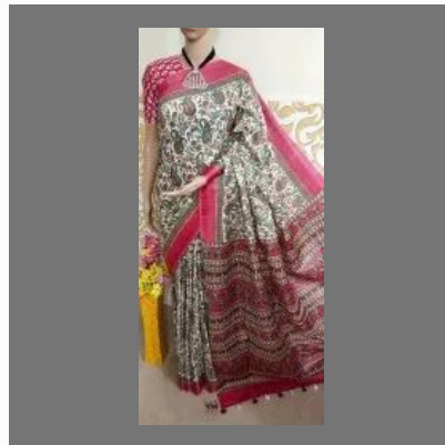
Cotton Hand Block Printed Saree