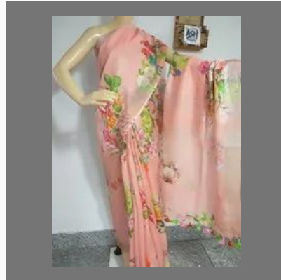
Peach Digital Printed Linen Saree