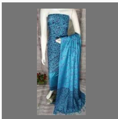
Ladies Printed Silk Dress Material