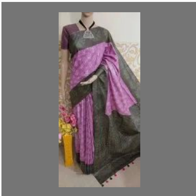
Purple Cotton Hand Block Printed Saree