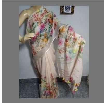
Ladies Digital Printed Linen Saree