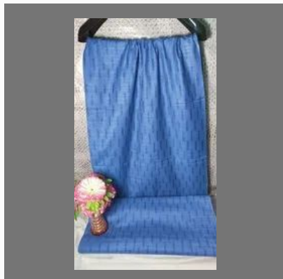
Cotton Ikat Fabric