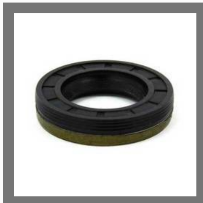
Oil And Grease Seals