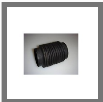
Molded Rubber Bellows