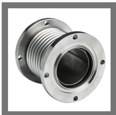
SS Expansion Joint