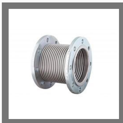
Metal Expansion Joint