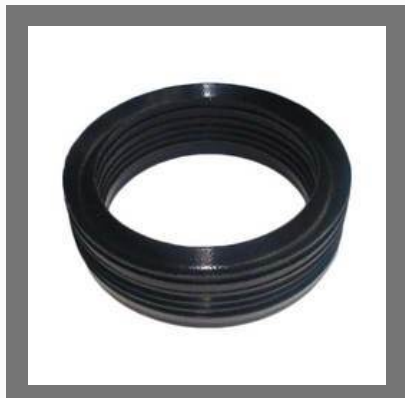
Vee Packing Seal